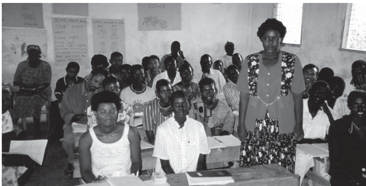
Pre-school refugee teachers undergo teacher training in one of the classrooms at Surat Pre-school at the Kakuma Refugee Camp in Kenya.