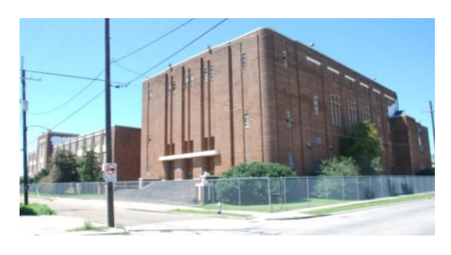
Figure 33: Booker T. Washington High School, New Orleans, Orleans Parish. Auditorium in foreground with school to be demolished in background.

2002, just the auditorium remains today, while the rest of the school was demolished as part of a broad revamping of New Orleans public school buildings. Such losses make the remaining buildings that symbolize African American's valiant fight for higher education even more important.