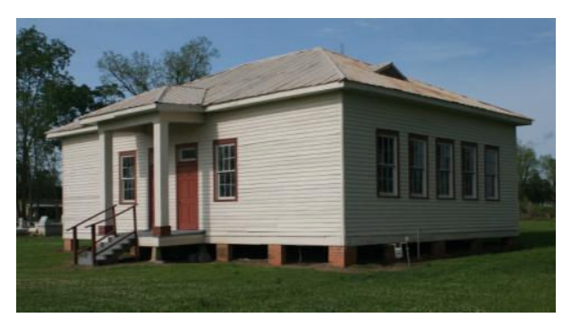
Figure 27: Goudeau School, Goudeau, Avoyelles Parish.

church. It is very probable that the first classes for African American children in this area were held in the original Antioch Baptist Church building which was constructed in 1899 and that the 1930s schools house built by the parish school board evolved out of this church-housed school. When the school house was decommissioned in the 1950s following the construction of George Washington Carver High School in Bunkie, it was purchased from the school board by Antioch's Burial Association. <sup>187</sup> Thereby, this school that probably had its origins in the church has been preserved through its ongoing connection to it and the dedicated work of alumni. It is an excellent example of a potentially eligible property of this type. Lesser examples could also be