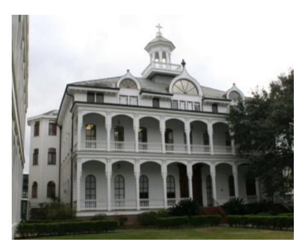
Figure 13: New Orleans Female Dominican Academy/ Greenville Hall, Loyola University, New Orleans, Orleans Parish.

The New Orleans Female Dominican Academy building of 1882 is a distinctive example of a Catholic school building constructed for white girls in the late nineteenth century (Figure 13). The school was founded as the St. John the Baptist School for Girls on New Orleans Dryades Street, in 1860 for the purpose of instructing the daughters of Irish immigrants. In 1861, it was chartered under the Dominican name. In 1864, the Dominican sisters purchased a new property for the school in the then suburb of Greenville, which is now the University neighborhood. The cornerstone for the new school was laid in 1882. The school which eventually became St. Mary's Dominican High School operated in this building until 1963, when it moved to a new facility. The surviving three-story, frame Italianate building is listed on the National Register for its architectural as well as its educational significance.