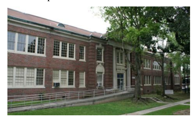
Figure 56: Louisiana School for the Deaf, Baton Rouge, East Baton Rouge Parish.

in a building formerly occupied by Baton Rouge College. It then moved into an impressive five story building with a view of the river, before relocating to the 1928 campus. It now occupies yet another campus, but the 1928 buildings are a significant part of this school's history. Historic special education school buildings are rare and need only to have a well-documented history as such and retain an easily recognizable historic appearance to be potentially eligible for the National Register. Location and setting are less important integrity issues for these properties, especially when they provided services to students from around the state as in the Louisiana School for the Deaf.