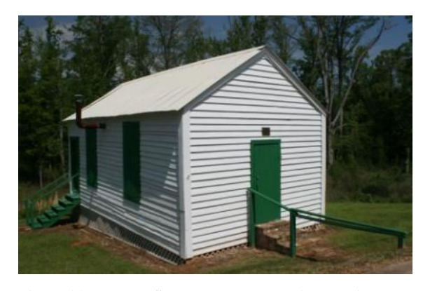
Figure 22: McNutt School, McNutt, Rapides Parish.

Although churches were often the one-room schools of African American communities, dedicated one-room school buildings did exist as well. These were typically roughly constructed in the first place and have not endured the passage of time. They are therefore rare buildings that should be considered eligible for their association with this context as long as they retain a minimal degree of integrity. Examples of one-room African American schools listed on the National Register are the McNutt School of c. 1910 in Rapides Parish and the Phillips School of 1918 in Winn Parish (Figures 22 and 23). It should be noted that both of these schools demonstrate the persistent significance of community churches in African American education because they share sites with churches. In this regard, their location is an important part of their history and context. However because one-room schools are rare, although integrity of location and setting is desirable, relocation should be acceptable as long as it does not adversely impact the resource and the new setting is similar to the original, or differences are outweighed by the significance and Figure 23: Phillips School, Emry, Winn Parish. other positive integrity factors of the building.