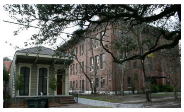
Figure 54: The Frank T. Howard School No. 2 caretaker's house stands in juxtaposition to the school building, New Orleans, Orleans Parish.

For some years, it was a trend to have a caretaker who would look after the school property housed in building near the school. The c. 1890 shotgun house next to the 1903 Frank T. Howard School No. 2 in New Orleans is an example of this. Until 2011, when it was auctioned, it remained a property of the Orleans Parish School Board (Figure 54). In order to be potentially eligible for the National Register in association with this context, a caretaker's house must not only have had a prolonged and well-documented use for this purpose, but must have had a demonstrable relationship with the process