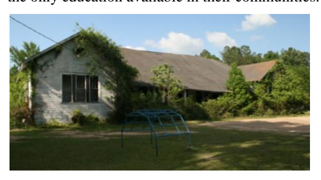
Figure 43: Tangipahoa School, Tangipahoa, Tangipahoa Parish.