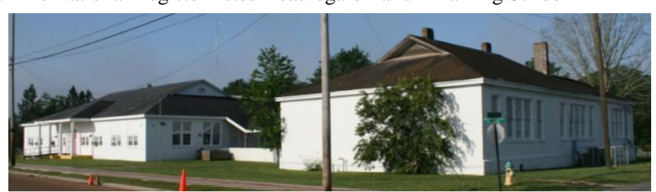
Figure 29: Beauregard Parish Training School, DeRidder, Beauregard Parish.

Central High School in Shreveport, opened as that city's first high school for African