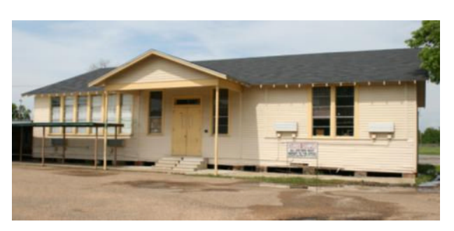
Figure 20: Plaisance Rosenwald School, Plaisance, St. Landry Parish.