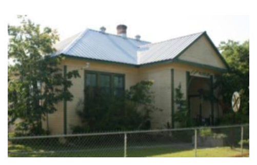
Figure 40: Lacombe School, Lacombe, St. Tammany Parish.

A step up from one-room schools was the rural frame school with multiple rooms. Some simply had two classrooms while some might have had as many as four classrooms and an auditorium. The auditorium in particular was an asset not just for the school, but for the community which might not otherwise have a large gathering space. There are presently four schools listed on the National Register which fit into this category. The 1913 Lacombe School in St. Tammany Parish is an example of a simple school building much like a oneroom school, but with two classrooms (Figure 40). The c. 1910 Hungarian Settlement School in Livingston Parish, the 1919 Shady Grove School in Beauregard Parish and the 1922 Tangipihoa School in Tangipihoa Parish are each examples of the larger type of frame school with multiple classrooms plus auditoriums (Figures 41-43). Like the one-room school houses, these schools provided the only education available in their communities.