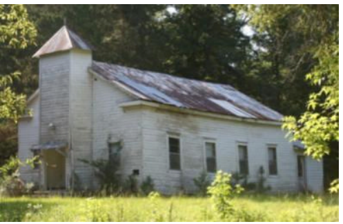
Figure 16: Clear Creek AME Church, Felixville, East Feliciana Parish.

and black students was not able to provide quality educational facilities for either. The two systems being anything but equal, African Americans of course received the lesser of the inadequate provisions. In the quasi-public system that developed, the meager school board support in the form of money, textbooks, or a teacher was supplemented by the community who provided the school facilities and any necessity not provided by the state. Particularly in rural areas, these facilities often ended up being the building that functioned as the heart of the community – the church. Students took their lessons on the same benches – typically made by community members – that served the church on Sundays. Whereas Catholic schools offered religious instruction, it was common for a Protestant church to house a completely secular quasi-public school. Examples of this phenomena listed on the National Register are Clear Creek AME Church of c. 1910 in East Feliciana Parish and St. Paul Baptist Church/ Moorhead School of 1910 in Allen Parish (Figures 16 and 17). Both of these churches retain very rural settings that contribute greatly to their historic feeling and overall integrity. Clear Creek AME Church is in a deteriorated condition. It appears to be suffering from a long term roof leak that has caused the loss of part of the floor and if not abated could do further damage. This highlights the tenuous existence of these types of properties, even when listed on the National Register.