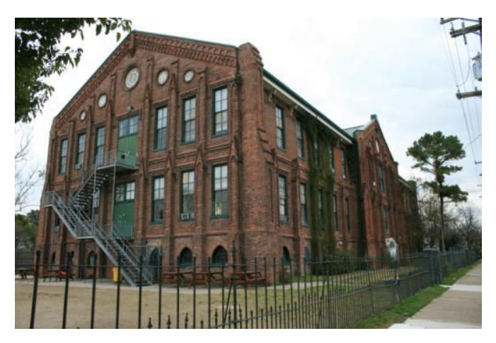
Figure 10: McDonogh School No.7, New Orleans, Orleans Parish.