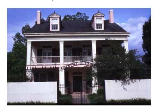
Figure 3: Academy of St. Basil's, Plaquemine, Iberville Parish.