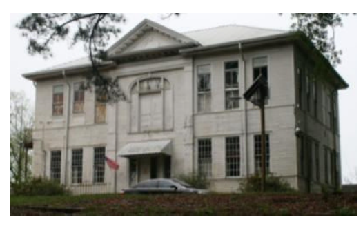
Figure 45: Clinton High School, Clinton, East Feliciana Parish.