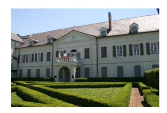
Figure 1: Ursuline Convent, New Orleans, Orleans Parish.

The first organized educational opportunity for women in Louisiana was provided by the Ursuline nuns in 1727. Although the first buildings in which the Ursulines taught did not survive the eighteenth century, their 1753 convent did and stands today as the oldest building in New Orleans' Vieux Carré, its peers having succumbed to fires (Figure 1). As such, it is of course quite significant and is listed on the National Register, but it is important to note its great significance as the second school in Louisiana, and the oldest surviving one. Although there have been changes to building, especially on the interior, but it would without a doubt