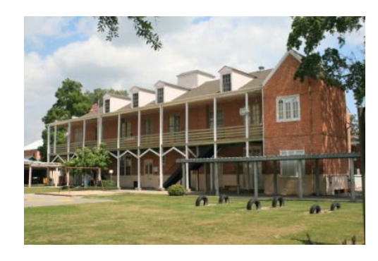
Figure 2: Ascension Catholic Primary, Donaldsonville, Ascension Parish.

Ascension Catholic Primary, has existed under different names since its founding in 1845 and its 1850 building has served as a hospital and convent as well as a school (Figure 2). Its role in the education of Louisiana at a time when formal schools were sparse, especially outside of the larger cities, renders it potentially significant for its association with education. In 1859, the Marianite Sisters of the Holy Cross purchased a private home in Plaquemine to which they moved a girls' school they had founded six years prior (Figure 3). This school became known as the Academy of St. Basil's and the building is listed on the National Register for the local significance of its Greek Revival architecture, but it also retains significance as an