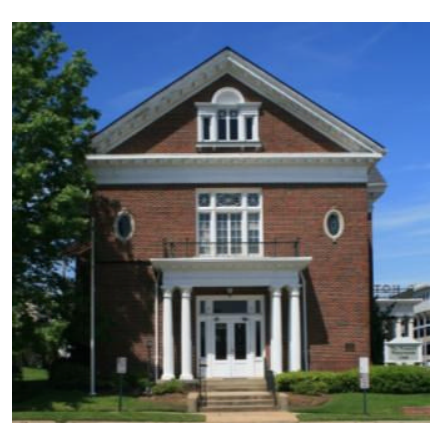
Figure 65: The Women's Department Club, Shreveport, Caddo Parish.

In many areas of school reform in the early twentieth century in Louisiana, women led the way. The Shreveport Women's Department Club is an example of this fact. The club instigated studies of schools, held lectures on education, and gave scholarships. Efforts such as these created the grassroots support that propelled education in Louisiana forward. The 1924-25 Shreveport Women's Department Club building is listed on the National Register for its importance in this area. To be eligible for Register listing in association with this context, miscellaneous properties with a significance to education in the state must be able to demonstrate that significance convincingly and retain a recognizable historic form and feeling.