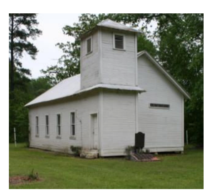
Figure 17: St. Paul Baptist Church/ Morehead School, Kinder vicinity, Allen Parish.