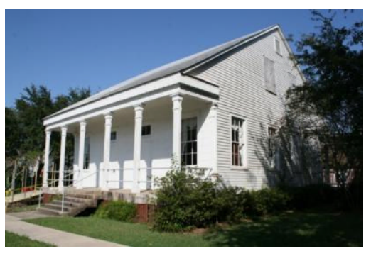
Figure 12: St. Joseph's School, Burnside, Ascension Parish.

Examples of early twentieth century Catholic schools listed on the National Register are Holy Rosary Institute of 1913 and Our Lady of Assumption School of 1934, both in Lafayette Parish. The Holy Rosary institute was founded as a school for the vocational and technical training of black women in the tradition of Booker T. Washington and also served as a Normal school for training teachers, and a high school. From the beginning, it was staffed by Sisters of the Holy Family. It is presently in a condition that imperils its future existence. Our Lady of Assumption was another one of the many Louisiana schools for African Americans operated with funding assistance from Mother Katherine Drexel.