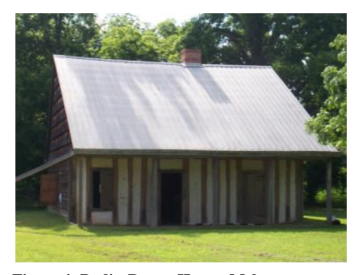
Figure 4: Badin-Roque House, Melrose, Natchitoches Parish.

The Badin-Roque House in Natchitoches Parish is listed on the National Register for its architectural significance as a very rare example of a poteaux-en-terre (posts-inground) house (Figure 4). Though built as a private residence, it became the school of St. Augustine Catholic Church in the late 1850s, serving free children of color. It later returned to being a private home again. Though it was used as a school for a relatively short period of time, this use of Badin-Roque House as a school by the Free People of Color of Isle Brevelle is a significant part of the story of the education of African Americans in the antebellum period.