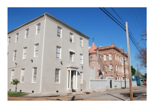
Figure 6: Holy Angels Academy, New Orleans, Orleans Parish.

While a number of Catholic schools opened during Reconstruction, particularly in New Orleans, the difficulties of the Civil War prevented much activity in Catholic education from 1862 to 1865. An extraordinary example of a school constructed during the war is the Holy Angels Academy (Figure 6). The cornerstone of the academy building was laid on May 3, 1862 and the school provided quality education to young women until the end of the twentieth century. The academy building, which has now been converted to apartments, and the other associated buildings of Holy Angels that housed the convent, normal school, concert hall, and cafeteria, are notable