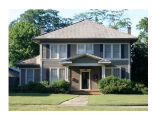
Figure 53: Teacherage, Homer, Claiborne Parish.

Specially designed teacher's housing conveys an important aspect of the development of education in the state. While today we expect teachers to be regular residents of the community, this was not always the case in the past. Because trained teachers existed in limited numbers, they typically had to be recruited from outside of smaller communities and were often offered accommodation in someone else's residence or in a separate teacher's house or teacherage. Some of these buildings were ordinary houses. Others, like the Homer Teacherage of c. 1920 in Claiborne Parish are distinctive because they provided multiple units for more than one teacher or a principal and teachers (Figure 53). There are