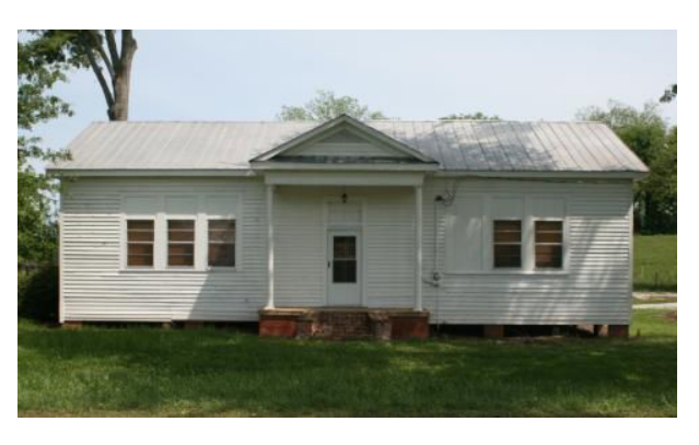
Figure 26: Odenburg School, Odenburg, Avoyelles Parish.

The two identified schools are in Odenburg and Goudeau (Figures 26 and 27). Both are estimated to have been constructed in the 1930s. The Odenburg School was long ago converted for use as a private residence. This was a practical course of adaptive reuse for these types of buildings when they were decommissioned as schools. The exterior of the Odenburg School retains a fair degree of integrity and would certainly be recognizable to a former student, but its residential use has led to many alterations of its interior that render it quite different from the days of its school use. Even though these kinds of buildings are believed to be rare, the loss of interior integrity seriously inhibits its ability to convey it significant associations with this context. On the other hand, the school at Goudeau is in such an immaculate state of preservation – complete with the initial of students scrawled into its wooden weatherboards in the 1940s – it resonates with historical feeling. Like so many African American schools of the early twentieth century, the Goudeau School sits next to a