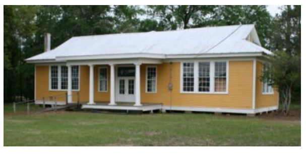
Figure 42: Shady Grove School, Shady Grove, DeRidder vicinity, Beauregard Parish.