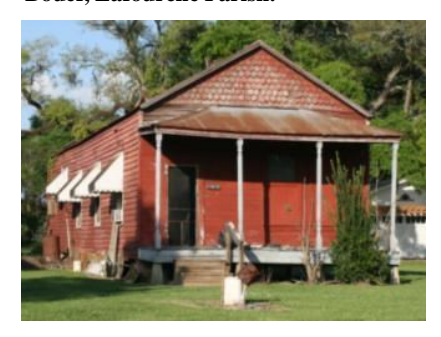
Figure 38: Little Red School House, Rosedale, Iberville Parish.