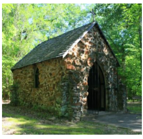
Figure 11: Rock Chapel, Carmel, DeSoto Parish.

In the late nineteenth century, after requiring that separate facilities be established for black and white parishioners in 1884, the Catholic Church realized the necessity of providing for the education of African Americans. Many historic documents record the opening of Catholic schools specifically for African American boys or girls at this time, but again, few survive. Two of the rare extant Catholic schools for African Americans of the late nineteenth century are Rock Chapel of 1891 in Desoto Parish and St. Joseph's School of 1892 in Ascension Parish (Figures 11 and 12). The Rock Chapel was built by Carmelite friars for their ministry to the African American population and they used it as a school during the week. Its operation was short lived however, as the friars left in 1897 following white opposition to their education mission. 184 St. Joseph's School for boys was founded in 1867, but in 1890 a tree fell on the building. Its replacement, the present building was constructed with a grant from the philanthropist Katherine Drexel. It is an exceptionally well-built school of its period, a fact to which it no doubt owes its continued existence. Originally, it held two classrooms. Although it was previously listed on the National Register, it was delisted because it had become part of a fake setting that never existed historically as the owner moved numerous historic but unrelated buildings onto the site.