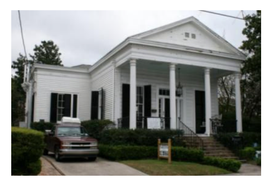
Figure 58: James Dillard House, New Orleans, Orleans Parish.