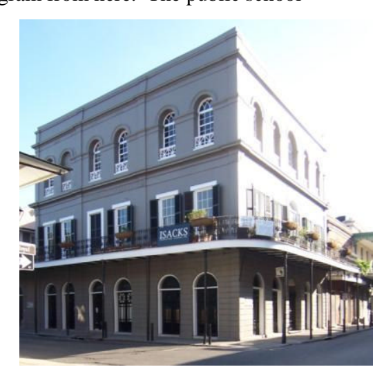
Figure 7: LaLaurie House / Lower Girls' School, New Orleans, Orleans Parish.

systems also continued the long standing practice of using residential and other buildings for schools. The two-story brick commissary building of Shady Grove Plantation is said to have served as the first school for African Americans in Iberville Parish. In New Orleans, the 1831 LaLaurie House, which is notorious as a site of the brutal torture of slaves, is less known for its significant use as the first integrated school in New Orleans in the 1870s. At this time it was rented by the New Orleans school board and housed the Lower Girls High School (Figure 7). Many buildings that served as African American schools in the late nineteenth and very early twentieth centuries have been demolished or reverted back to other uses that have obscured this aspect of their history. Therefore, examples of repurposed buildings known to have been used as African American schools are rare. In spite of their rareness, however, the eligibility of these resources must be carefully considered.