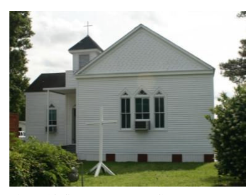
Figure 14: St. Paul Lutheran Church, Mansura, Avoyelles Parish.

Although so many church-based schools were not religious, there were some non-secular Protestant schools for African Americans. Such schools tended to be better funded and offered a higher quality educational experience than their quasi-public secular counterparts. A National Register listed example of this type of school is St. Paul Lutheran of 1916 in Avoyelles Parish (Figure 14).