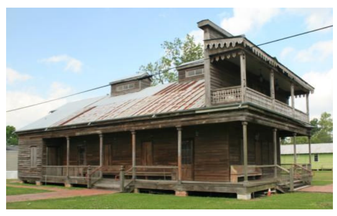
Figure 25: Dorseyville School, Dorseyville, Iberville Parish.

In the twentieth century multiple-room frame schools for African Americans were often constructed with funding from the Rosenwald Foundation following that organization's plans, but this does not seem to have been a popular form for public schools or quasi-public schools built without Rosenwald support. This conclusion is based the historic background research conducted for this project, review of the state's "Standing Structures Survey" files and fieldwork. Much further research