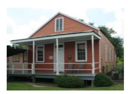
Figure 37: Bayou Bouef Elementary School/ Little Red School House, Bayou Bouef, Lafourche Parish.

There are two one-room school houses built for white students presently listed on the National Register. The Bayou Bouef Elementary School, also known as the Little Red School House, of 1904 in Lafourche Parish and the Brister School House of c. 1915 in Winn Parish are two excellent representations of the type of small frame buildings that accommodated rural schools at the beginning of the twentieth century. The Bayou Bouef Elementary School is an example of a public school that was constructed by the school board (Figure 37). It is a typical school house of this period 25 X 40 feet in dimension with a gable front roof and small front porch. Apparently red was a standard paint color for school houses as this school, like many others of the period, was also known as the Little Red School House. A building of a very similar design in Iberville Parish, that has long been a private residence, is also said to have been called the Little Red School House (Figure 38). Bayou Bouef Elementary School was moved from its original location when a new elementary school was built and now stands on the campus of that later school. Although the facilities of that school definitely impose on the feeling of setting of the school, it retains National Register eligibility because of its significance as a rare surviving one room school house.