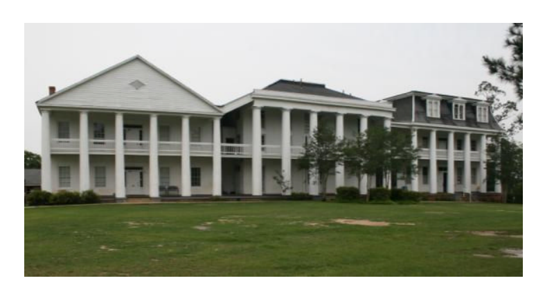
Figure 5: Silliman Female Collegiate Institute, Clinton, East Feliciana Parish.

Although many private academies were in operation prior to the Civil War and many opened during the period of state subsidies to private schools in the 1830s, few remained in operation after the Civil War and buildings associated with antebellum private schools are very rare. One known example is the school originally known as the Silliman Female Collegiate Institute, in East Feliciana Parish, which is listed on the National Register for its