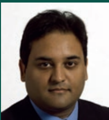
Claude Moraes MEP