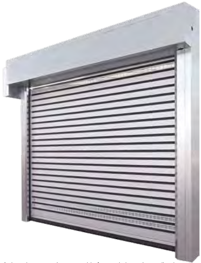
A door that opens incomparably fast and closes immediately after increases safety in sensitive areas.

One's own ambitions are the strongest drive for outstanding performance: Common garage doors are calculated to go through approximately 5 opening cycles a day, but the EFA-SST® PS is designed for 200,000 work cycles a year. That's why no other door can be compared to the EFAFLEX doors for durability and capacity. Due to the slender laths, the parking system door is also very solidly constructed and guarantees a higher wind load capacity than any other high-speed door. Of course, EFAFLEX guarantees the highest operating safety as standard even after years of continuous use.