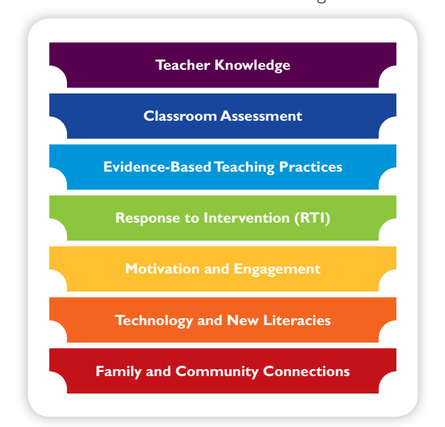
Figure 1.1 The Seven Pillars of Effective Reading Instruction