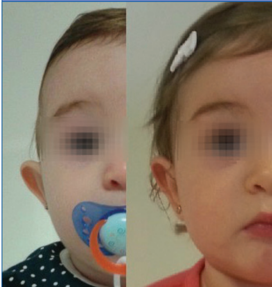
Figure 2. Picture of the patient at the end and the beginning of the study

After 12 months, a questionnaire was completed by the parents or guardians of 38 participants. Questions of a subjective nature were answered on a scale from 1 to 10.