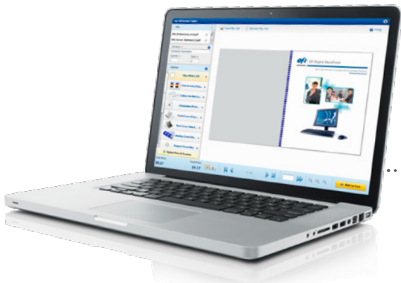
Customized branded websites provide 24/7 customer access to submit orders and track their jobs.