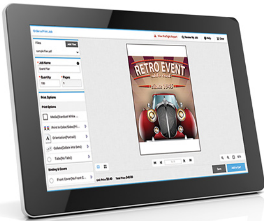
Visual Product Builder is HTML5 and desktop, tablet and mobile ready.