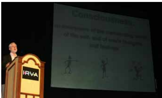
Skip Atwater: