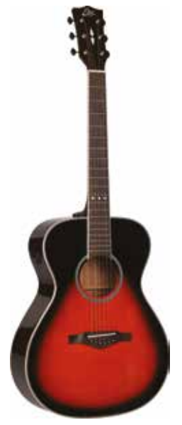
EGO ICON II EQ EGO SERIES COLORS: Natural