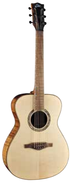
INFINITO 018 THE ITALIAN SERIES COLORS: Natural