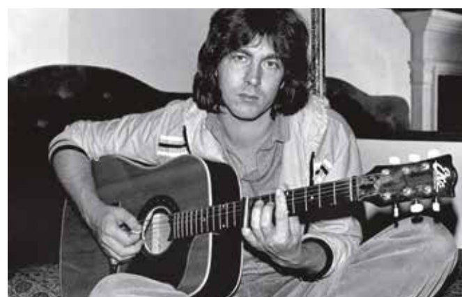
Mick Taylor is an English musician, best known as a former member of John Mayall's Bluesbreakers and the Rolling Stones.