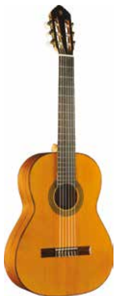
VIBRA 300 (CITES) VIBRA SERIES COLORS: Natural