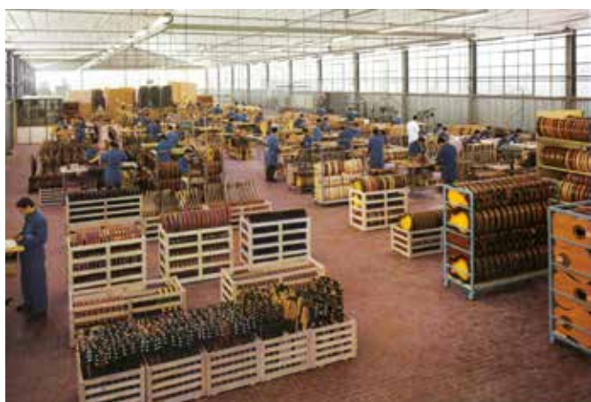
Part of Eko production. Superior techniques bring modern day production to an industry using individual hand craftsmanship as old as the guitar.

In a few years, Eko made a technological and economic leap forward, through the direct manufacture of electric (guitars) and electronic (organ) instruments.