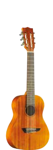
DUO GUITALELE DUO SERIES COLORS: Natural