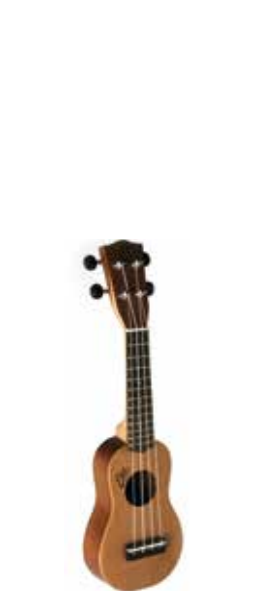
EVO MICROLELE EVO SERIES COLORS: Natural