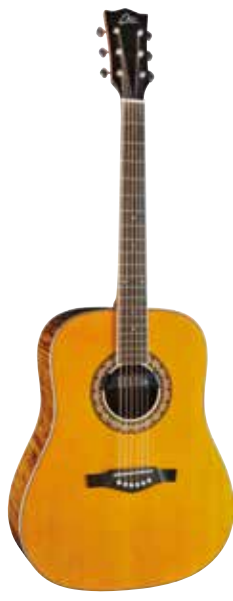
RANGER FUTURA THE ITALIAN SERIES COLORS: Natural