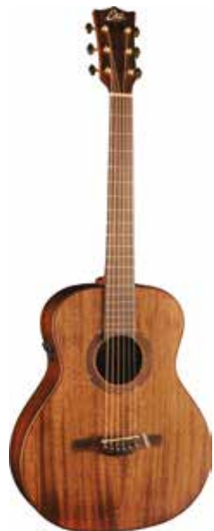
MARCO POLO MM EGO SERIES COLORS: Natural

ACCESSORIES PICK-UP HEART SOUND PICKUPS BAGS