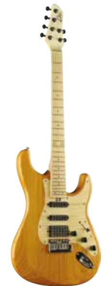
AIRE STANDARD ELEMENTS SERIES COLORS: Natural