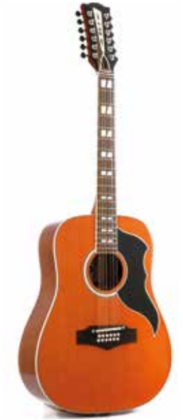
RANGER XII VR TOP STAINED VR SERIES COLORS: Natural/Honey Burst EQ: Yes