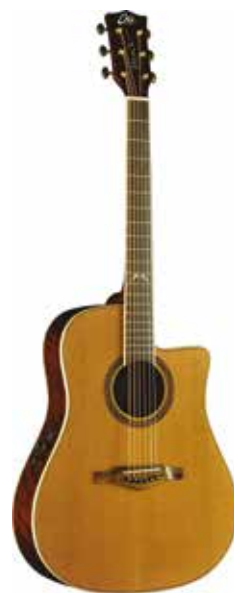
MIA IV D CW EQ MIA IV SERIES COLORS: Natural