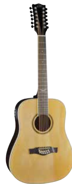
NXT D XII EQ NXT SERIES COLORS: Natural