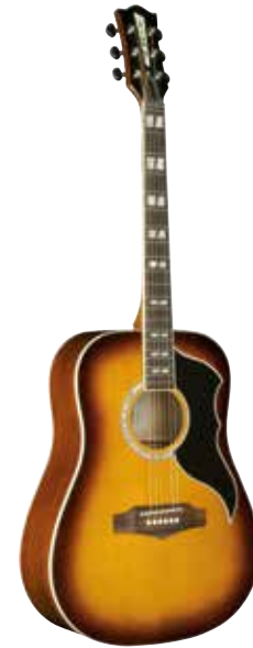
RANGER VI VR TOP STAINED VR SERIES COLORS: Natural/Honey Burst EQ: Yes