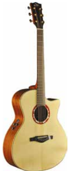
ALPS 018J EQ EGO SERIES COLORS: Natural