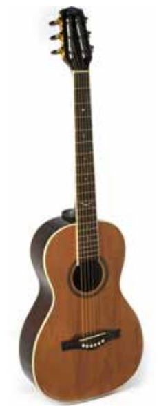
NXT PARLOR NXT SERIES COLORS: Natural/Black