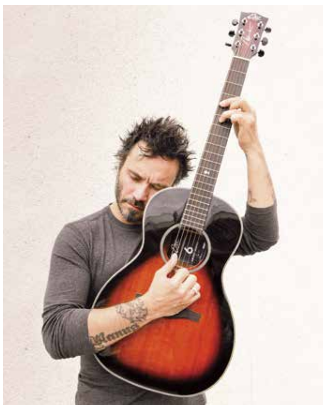
The singer, songwriter and musician Nek and his Nek Signature (based on the Ego Legend, following the artist requirements to have a very performing guitar for stage but also for studio recording sessions).

Eko officially resume the production and distribution of its acoustic and electric guitars, both at industrial and artisan level.