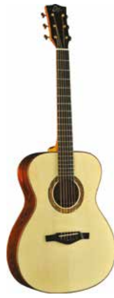
WOW COCOBOLO WOW SERIES COLORS: Natural