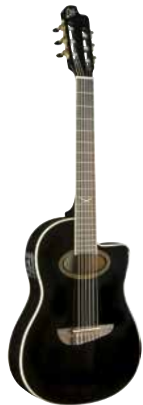
NXT NYLON CW EQ NXT SERIES COLORS: Natural/Black