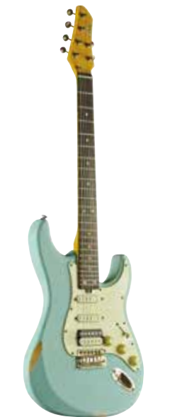
AIRE RELIC ELEMENTS SERIES COLORS: Sunburst/Fiesta Red/ Daphne Blue