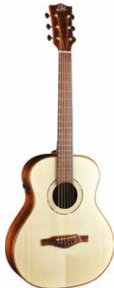
MARCO POLO 50 EGO SERIES COLORS: Natural