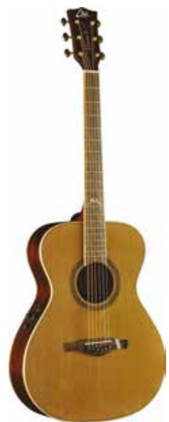
MIA IV 018 EQ MIA IV SERIES COLORS: Natural