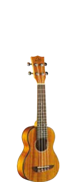
DUO UKULELE SOPRANO DUO SERIES COLORS: Natural EQ: Yes SHAPE: Soprano/Concerto