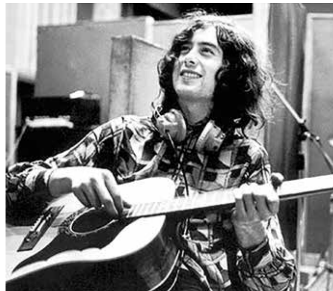
Jimmy Page can be seen in this image with a Eko Ranger VI. According to Pro Guitar Shop, "This acoustic was used to record the rhythm track for Thank You at Morgan Sound Studios in 1969."