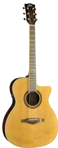
MIA IV 018 CW EQ MIA IV SERIES COLORS: Natural