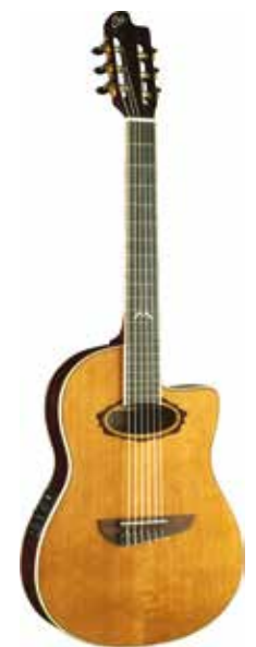
MIA IV NYLON EQ MIA IV SERIES COLORS: Natural