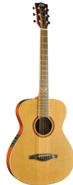
EVO III BARITONE BLEND EQ EVO SERIES COLORS: Natural