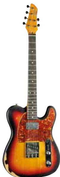
TERO RELIC ELEMENTS SERIES COLORS: Sunburst