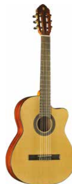
VIBRA 150 EQ VIBRA SERIES COLORS: Natural