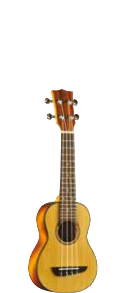
EVO UKULELE SOPRANO EQ EVO SERIES COLORS: Natural SHAPE: Soprano/Concerto