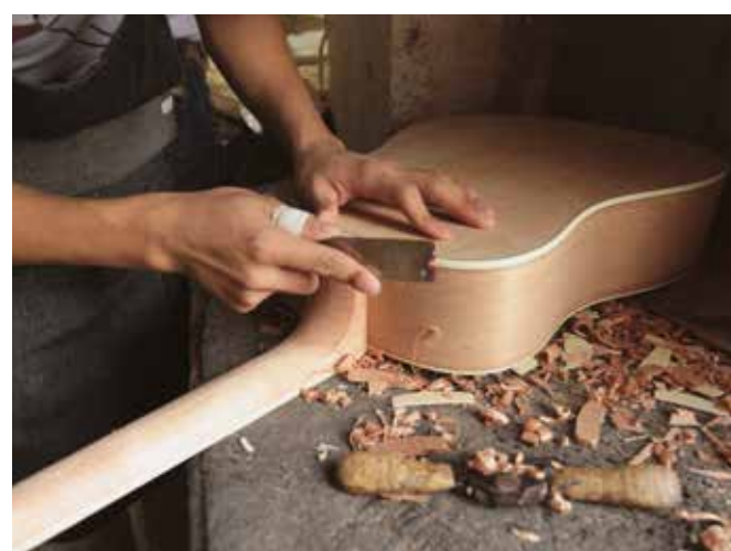
Historical photo of an handmade Eko Guitar.

After having experienced a period of splendor, and subsequently of decline, the company has risen from its ashes like a phoenix, to take flight and now succeed in being competitive on the market and producing quality instruments.