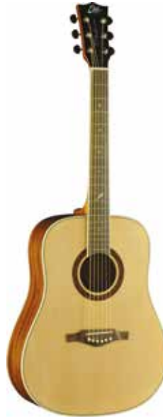
ONE D ONE SERIES COLORS: Natural/Vintage Burst EQ: Yes