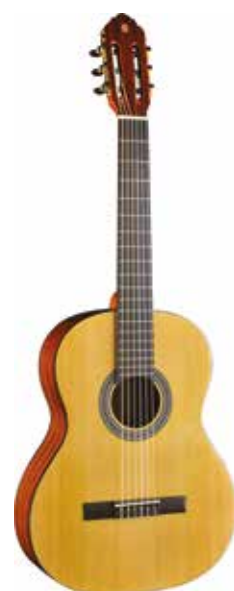
VIBRA 100 VIBRA SERIES COLORS: Natural