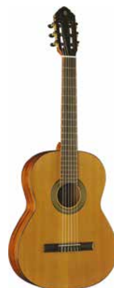
VIBRA 200 VIBRA SERIES COLORS: Natural