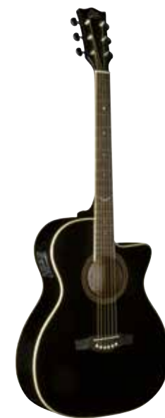
NXT 018 CW EQ NXT SERIES COLORS: Natural//Black/ Blue Sunburst