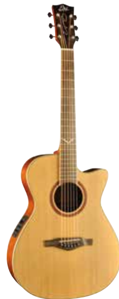
EVO III 018 CW BLEND EQ EVO SERIES COLORS: Natural