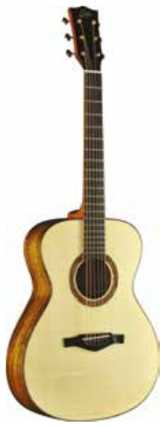
WOW KOA WOW SERIES COLORS: Natural