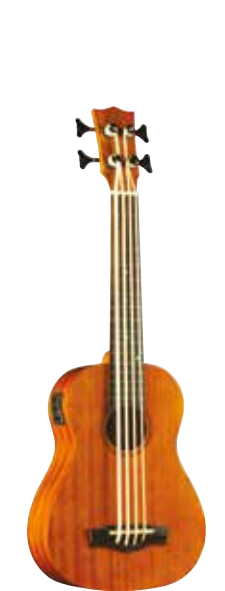
DUO UKUBASS DUO SERIES COLORS: Natural