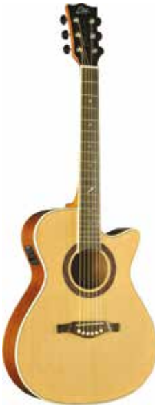
ONE 018 CW EQ ONE SERIES COLORS: Natural/Vintage Burst