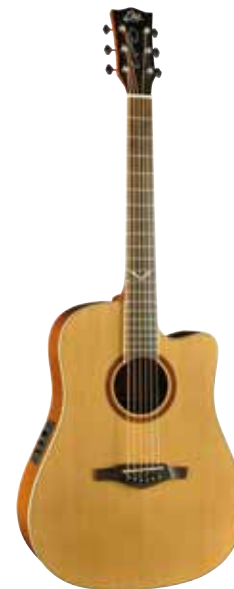
EVO III D CW BLEND EQ EVO SERIES COLORS: Natural