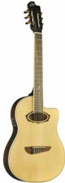
ONE ST NYLON EQ ETS ONE ST SERIES COLORS: Natural/Vintage Burst