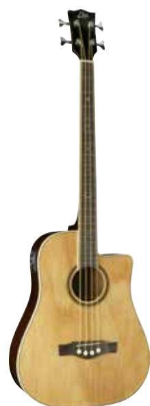
NXT BASS D CW EQ NXT SERIES COLORS: Natural/Black