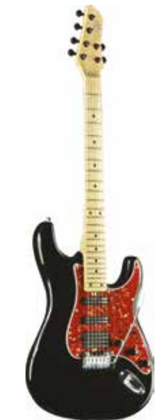
AIRE LITE ELEMENTS SERIES COLORS: Black/Sunburst