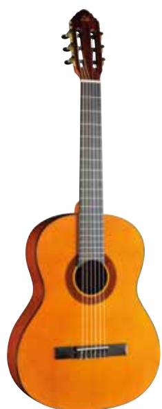
CS15 CS SERIES COLORS: Natural