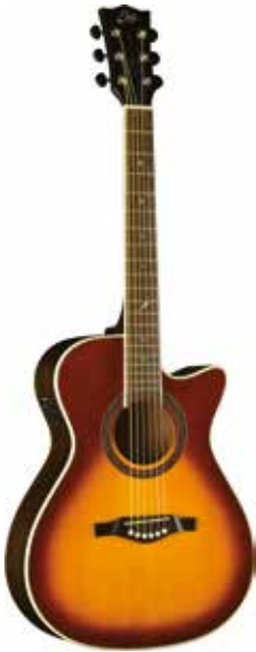
ONE ST 018 CW EQ ETS ONE ST SERIES COLORS: Natural/Vintage Burst