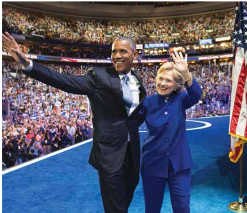
A Clinton presidency would build on President Obama's efforts to reduce America's carbon footprint.

Republican candidate Donald Trump has called climate change "a hoax." He has threatened to dismantle the Environmental Protection Agency, rip up the Paris Climate Agreement, lift restrictions on coal, expand drilling operations, and stifle the growth of