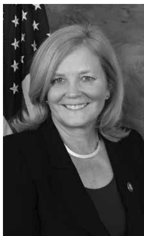
Environmental champion, Congresswoman Chellie Pingree.

There is no stronger environmental champion in Congress than Maine 1 st District Representative Chellie Pingree. She has earned a lifetime 95 percent pro-environmental record from the League of Conservation Voters.