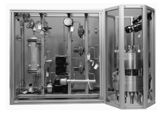
Figure 4. 875-bar EHC system assembly