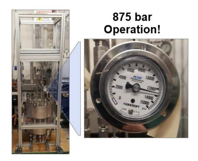
Figure 3. EHC stack operating at 875 bar

In addition to operating the EHC at a pressure of 875 bar under various inlet pressures and operating current densities, Giner-ELX demonstrated the ability of the 875-bar EHC to operate at <250 mV/cell and at an elevated current density of 1,000 mA/cm<sup>2</sup>. Utilizing the SSM membrane and the advanced EHC stack design, the cell voltage performance under constant output pressure of 875 bar was measured at 178 mV/cell at 500 mA/cm<sup>2</sup> and 276 mV/cell at 1,000 mA/cm<sup>2</sup>. Additional improvements in cell voltage of up to 60 mV over an operating current density range of 500–1,000 mA/cm<sup>2</sup> have been achieved with the use of hybrid membranes. The hybrid membranes consist of an admix of sulfonated polymers. Giner-ELX and team will continue evaluation and optimization of these new membranes in Year 3.