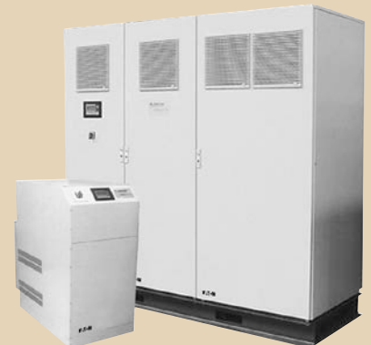
Sag ride-through (SRT2)