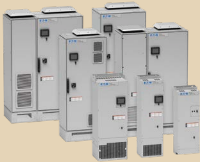
Harmonic Correction Unit