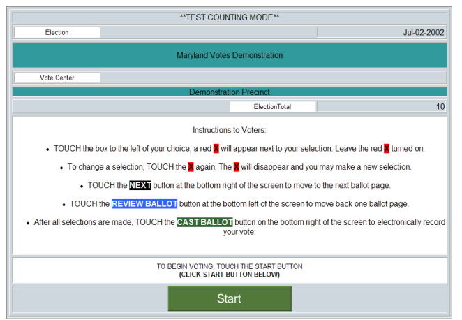
Figure 4: Diebold help page