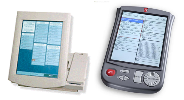
Figure 1: Diebold AccuVote-TS system (left) and Hart InterCivc eSlate system (right)

The Diebold AccuVote machine is the system that we tested, and is in use in the State of Maryland. It uses a touch screen (Figure 1) with a card reader that the voter gets after being authenticated by polling officials. Detailed screen shots are shown Figures 4-6.