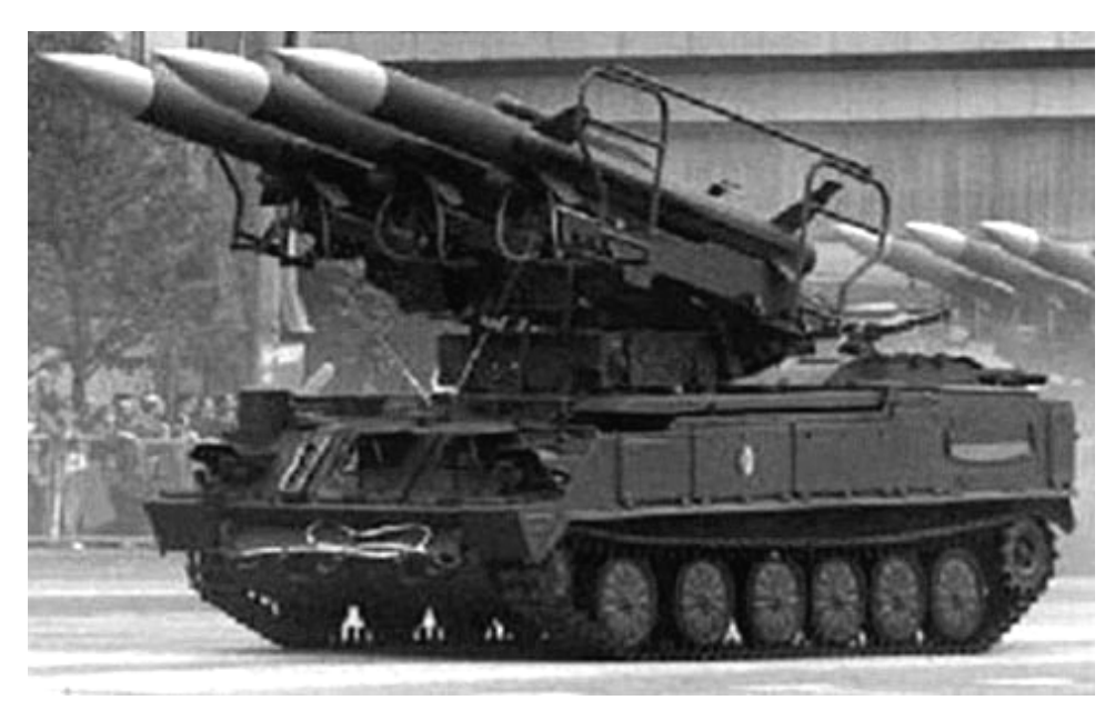
Figure 3: Mobile SA-6 Surface-to-Air Missile System

Additionally, many nations, including some hostile to U.S. interests such as Iraq and North Korea, operate what is referred to as integrated air defense systems. These systems use various means to track and target aircraft, including modern telecommunications equipment and computers to create networks of early warning radar, missile system radar, and passive detection systems that pick up aircraft communications or heat from aircraft engines.<sup>6</sup> Integrated networks provide air defense operators with the ability to track and target aircraft even if individual radar elements of the network are jammed or destroyed.