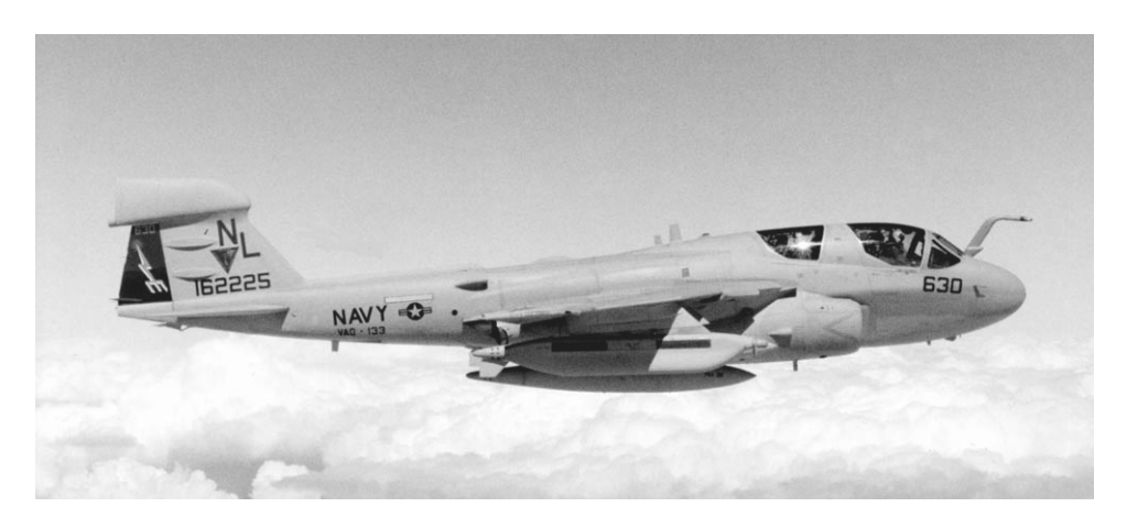
Figure 2: EA-6B Prowler

Radar is the primary means used by enemy forces to detect, track, and target U.S. aircraft. Hence, U.S. suppression aircraft focus on trying to neutralize, degrade, or destroy the radar equipment of an enemy's air defense system. Enemy radars in the past were often fixed in position, operated in a stand-alone mode, and turned on for lengthy periods of time—all of which made them relatively easy to find and suppress through electronic warfare or physical attack.