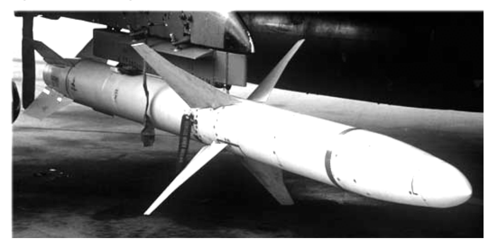
Figure 1: AGM-88 High-Speed Anti-Radiation Missile

among the first to be called in and the last to leave. Suppression aircraft such as the now retired EF-111 and F-4G played a vital role in protecting other U.S. aircraft from radar-guided missile systems during Operation Desert Storm in Iraq. In fact, Air Force strike aircraft were normally not permitted to conduct air operations unless protected by these suppression aircraft. The EF-111 was equipped with transmitters to disrupt or "jam" radar equipment used by enemy surface-to-air missile or anti-aircraft artillery systems. The F-4G used anti-radiation missiles that homed in on enemy radar systems to destroy them (see fig. 1).