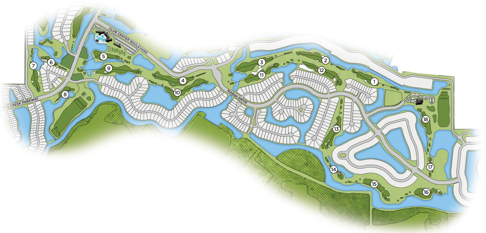
CREEK COURSE RENUMBERING