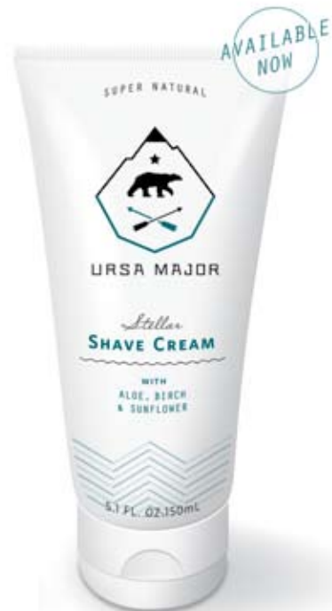
Stellar SHAVE CREAM