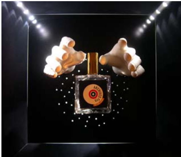
THE ILLUSION OF SEX