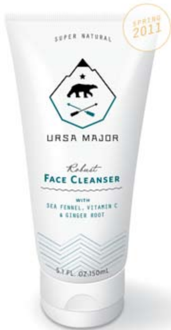
Robust FACE CLEANSER