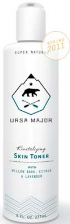
Revitalizing SKIN TONER