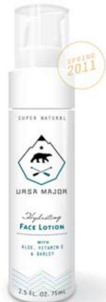
Hydrating FACE LOTION