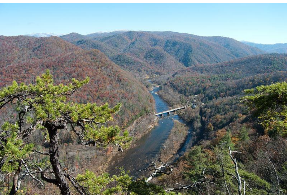
The Nolichucky River approaching Erwin from the east as seen from the Appalachian Trail

Erwin, Tennessee is located on the eastern edge of the state on the Nolichucky River and is the county seat of Unicoi County. The Appalachian Trail passes nearby. The town was originally named Ervin, in honor of D.J.N. Ervin who donated the land for the county seat, but a post office error labeled the town "Erwin," and this was never corrected. Between 1910 and 1920, the population increased from 1149 to 2965 (in 2010, it was 6097). Blue Ridge dishware originated in a pottery established in Erwin in 1916 (encouraged by the Carolina, Clinchfield, and Ohio railroad, and incorporated as Southern Potteries in 1920), and may explain the population increase in the latter part of that decade. In 1916, the year in which the play is set, the town had the region's largest railroad yard.