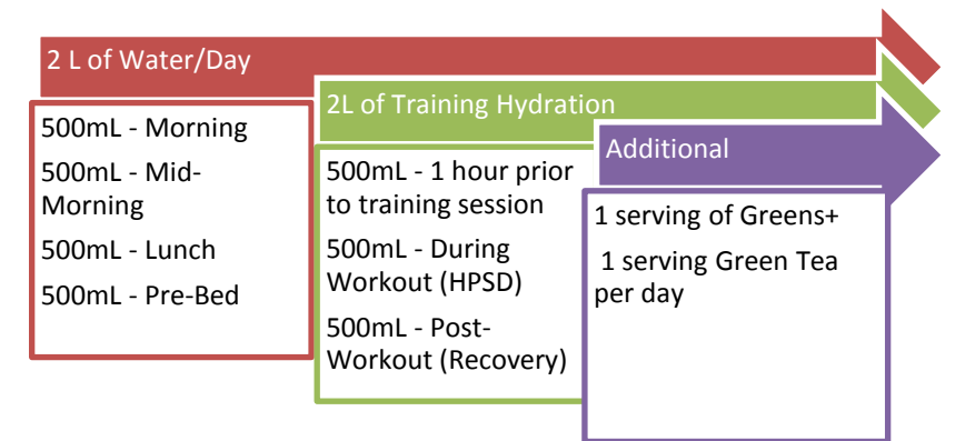
Figure 1: Hydration Schedule

Hydration is the FOUNDATION of our Athlete High Performance Nutrition Program. Our nutrition program requires athletes to drink 2 L of water each day in addition to their training and workout hydration (see chart below). This will ensure your hydration is not a limiting factor in your training and results. Water will help your body recover and maintain its ability to continue performing at a high level. Dehydration slows down recovery and will reduce your training gains.