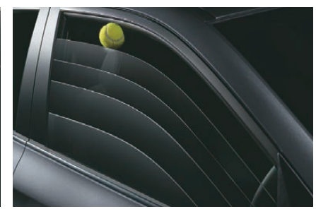
Auto up/down power window with pinch guard