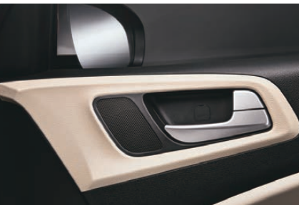
Impact sensing door unlock & speed sensing auto door lock (standard)