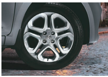
R16 diamond-cut alloy wheels