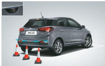
Reverse parking camera with sensors