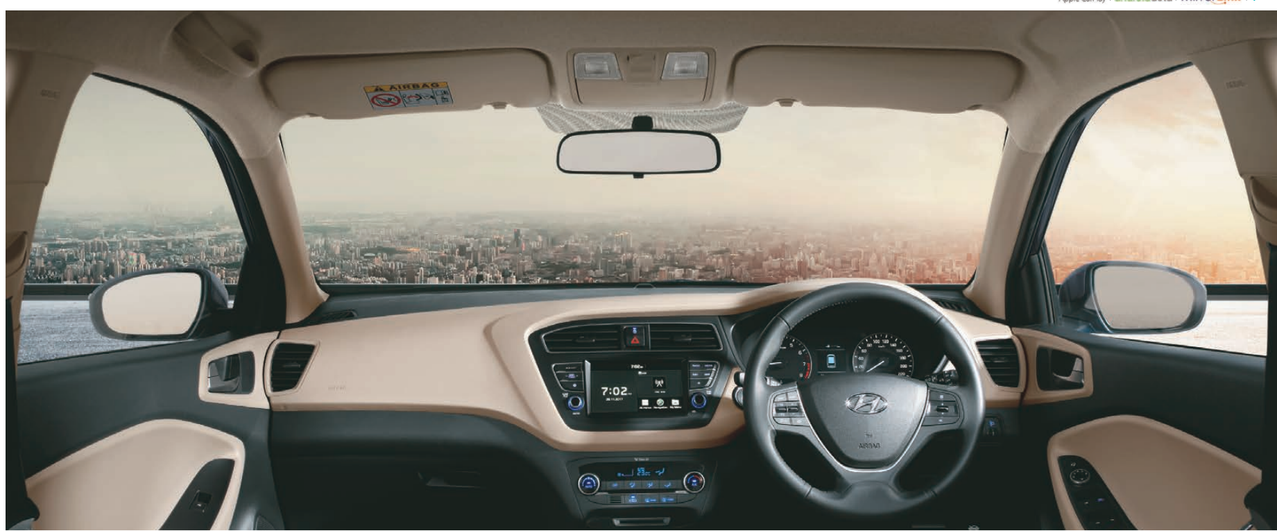
17.77cm touch screen with IPS display Audio video navigation system