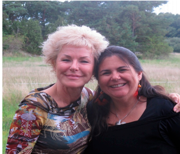
Figure 6. The authors in Sweden.

have often been the unit of comfort and survival for many people on the planet. The love and care offered by women, particularly mothers and grandmothers, has kept people safe, fed and nurtured across the generations. In acknowledging this global tradition of female care, we lift our hats and say “All our relations!—Kakionewagemenuk!”. See Figure 6.