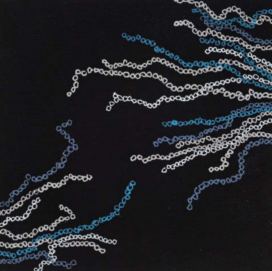
DOROTHY SCHWARTZ, ENDLESS FORMS V, 2008