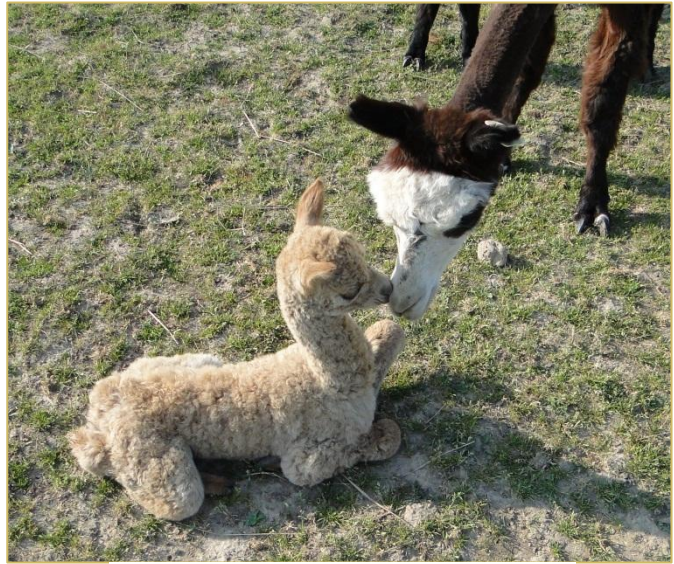
Manfred & Rita

Five Oaks Farm began operation in March of 2005 with one pregnant female and four males. Since then we have grown to five female and eight male alpacas, one llama and a huarrizo (Gizmo is half alpaca and half llama). They are kept company by one goat and two miniature donkeys.