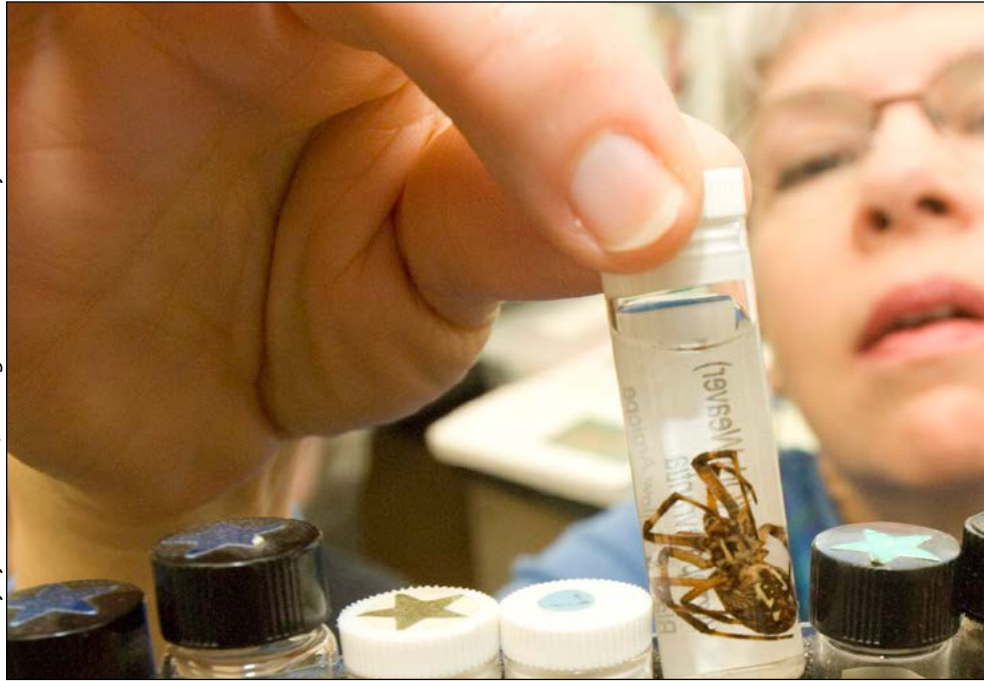
Figure 10. An OSU Master Gardener volunteer in Clackamas County examines a preserved specimen of a spider while researching an answer to a client's question.