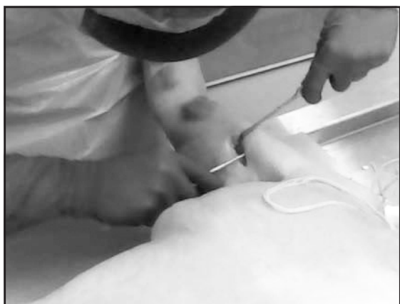
Raising the axillary artery.

The artery should be a major artery, such as the carotid artery or the femoral artery. Many embalmers choose to raise the accompanying vein in order to do what is referred to as a one-point injection at a single site (a one-point injection is an embalming where only one artery at one site needs to be open). Other embalmers choose to raise a vein at a different site than the artery: this is called split injection and drainage . Embalmers may also choose to raise more than one artery, or a multi-point injection : this can provide a more complete embalming, or be used in special embalming cases (when raising more than one artery can be necessary to achieve even a satisfactory embalming). If the embalmer is required to raise both arteries and veins from all three major injection sites, this is called a six-point injection .