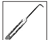
Slotted handle aneurysm hook

Let's start with the aneurysm hook , probably the most recognizable and widely-used of all of the embalming instruments. The aneurysm hook is a handle with a blunt hook on the end. This instrument can be used