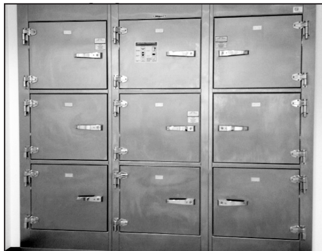
This cooler has individual lockers for nine bodies.

Coolers can drastically range in size and style. Many cooling units are custom made for the space available. The refrigeration temperature should range from 35-45 degrees Fahrenheit. Coolers should have the capacity to be locked, and have a detailed log of each decedent going in and out of the cooler.