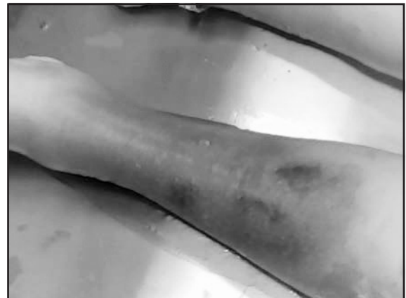
Discolored tissue in the lower extremity indicating poor circulation, like that caused by diabetes.

When a diabetes case is presented, the embalmer must keep in mind that there are several conditions that will most likely accompany the disease. These conditions include acidosis , arteriosclerosis , dehydration , gangrene , pruritus , and decubitus ulcers , and emaciation . Acidosis is the increase of acidity in the blood; the presence of this excess acid will require a higher preservative demand. Arteriosclerosis , or the narrowing of the arteries caused by calcification, causes poor circulation during life and will affect and limit the fluid distribution during the arterial embalming. Diabetics tend to exhibit dehydration due to excessive urination and changed osmotic balance during life; since the embalming is actually dehydrating the body even more, special attention should be given to making sure the body has enough moisture. Gangrene , pruritus , decubitus ulcers , and emaciation are also common, and will be discussed in their own sections below.