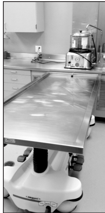
Embalming table set up in the prep room. The foot end is slightly lower than the head end and is over the drain bowl. Notice the draining channel that goes all the way around the table.

Tables are used for moving bodies, embalming, dressing, cosmetizing, and storing, among other usages. They can be solid and sturdy tables that are made to stay in one place, or they can be light and mobile to more easily move bodies around. Some tables are adjustable, and some fold in half for easy storage.