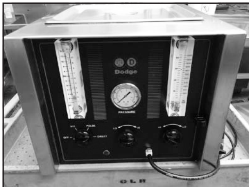
High pressure embalming machine manufactured by The Dodge Company.

Today, the most commonly-used injection apparatus is the embalming machine or centrifugal pump . Most centrifugal pump embalming machines contain a large tank to hold the embalming solution, and are able to maintain a constant flow with a predetermined pressure. Many machines allow the embalmer to control the pressure and rate of flow: the embalmer sets them prior to injection, and then adjusts them as needed during the embalming process. Some modern machines even automatically set the rate of flow and pressure for the embalmer. ( Pressure and rate of flow will be discussed in more detail on page 11 of this text. )