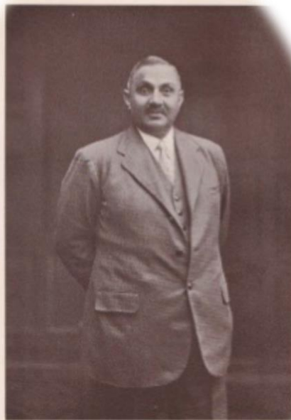
“... better known as ‘Ranji’ ...”