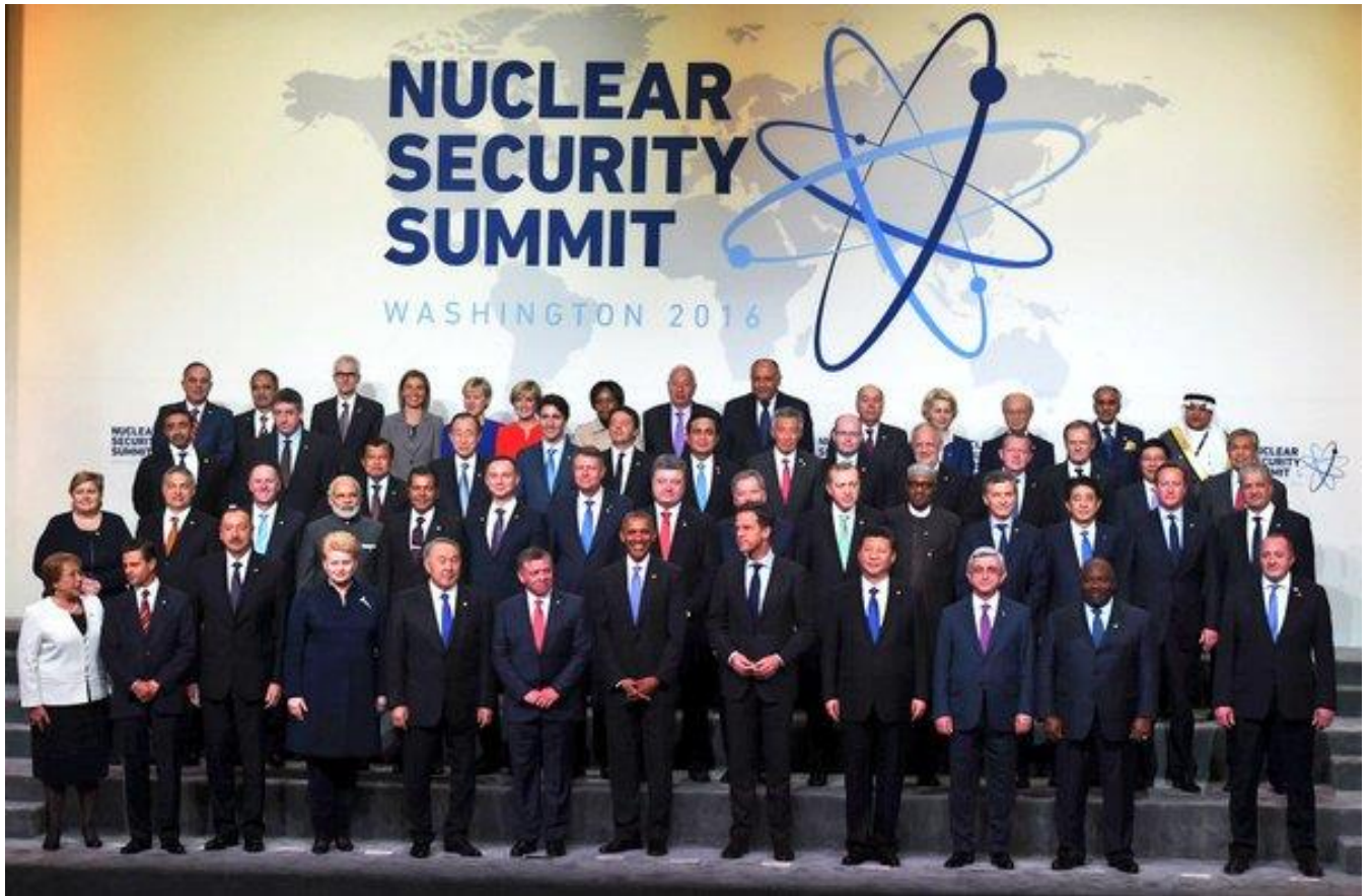
Standing together for nuclear security. Prime Minister Narendra Modi joins leaders for the family photo at Nuclear Security Summit 2016.