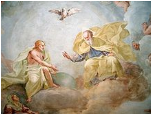
Holy Trinity , fresco by Luca Rossetti da Orta, 1738-9 (St. Gaudenzio Church at Ivrea, Torino).