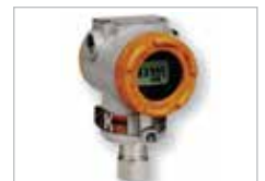
INDUSTRIAL PRESSURE TRANSMITTER