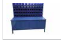
MS WORK BENCH