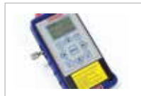
DIFFERENTIAL PRESSURES ELECTRONIC MANOMETER