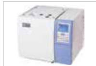
GAS CHROMATOGRAPHY SYSTEM