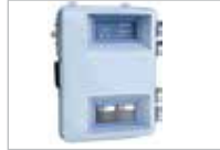
WATER HARDNESS ANALYSER