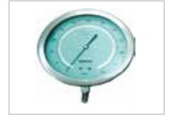
TEST PRESSURE GAUGE