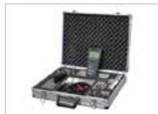
PORTABLE CLAMP-ON ULTRASONIC FLOWMETER