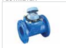
WATER METER - FLANGED TYPE