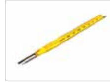
GLASS REFILL THERMOMETER