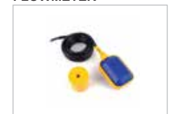
CABLE FLOAT SWITCH