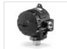
FLAME PROOF PRESSURE SWITCH