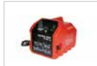
PRESSURE TEST PUMP ELECTRIC