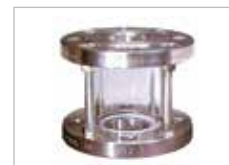
SIGHT FLOW INDICATOR