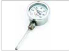
BI-METAL/GAS FILLED TEMPERATURE GAUGE