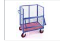
PLATFORM BOX TRUCK BASE