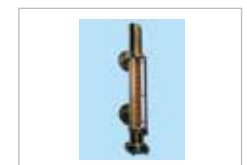
MAGNETIC BI-COLOR LEVEL INDICATOR