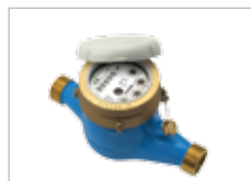
WATER METER-THREAD TYPE