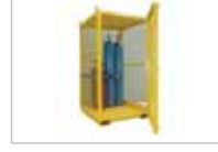
GAS CYLINDER CAGE