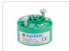
HEAD MOUNT TRANSMITTER