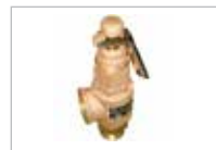
BRONZE SAFETY RELIEF VALVE