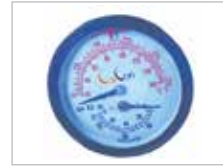
PRESSURE + TEMPERATURE GAUGE