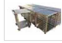
SS PANTRY TROLLEY