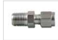
COMPRESSION MALE CONNECTOR