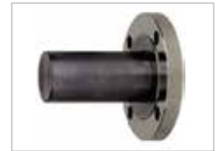
EXTENDED DIAPHRAGM SEAL