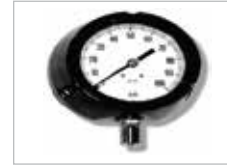
PHENOLIC CASE PRESSURE GAUGE