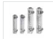
ACRYLIC FLOW METER