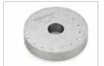
TOOLS STEEL RING