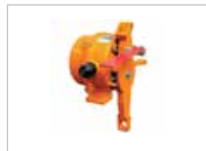
CONVEYER - SAFETY CABLE PULL SWITCH