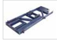
STRUCTURAL STEEL BASE