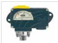
DIAPHRAGM PRESSURE SWITCH