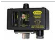
COMPACT PRESSURE SWITCH