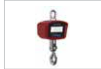
CRANE HANGING SCALE