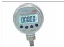
DIGITAL PRESSURE RECORDER