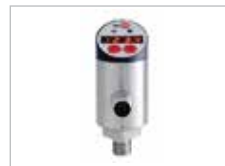
ELECTRONIC PRESSURE SWITCH