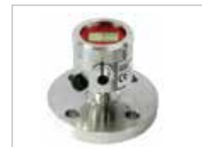
PRESSURE TRANSMITTER WITH SMARTER MODULE