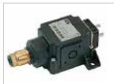
MECHANICAL PRESSURE SWITCH