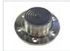
DIAPHRAGM SEAL FOR PAPER AND PULP INDUSTRY