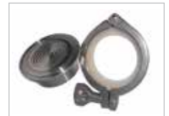
TRICLOVER DIAPHRAGM SEAL