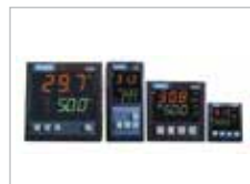
PANEL MOUNT INDICATOR/ CONTROLLER