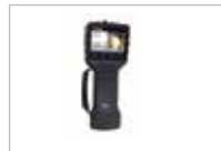
SPM BEARING MONITOR