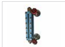
TRANSPARENT LEVEL INDICATOR