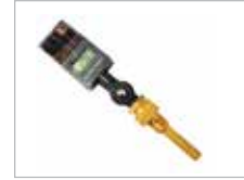
DIGITAL TEMPERATURE GAUGE