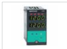
PID TEMPERATURE CONTROLLER