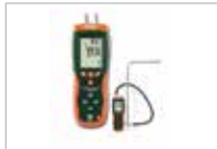
PITOT TUBE ANEMOMETER