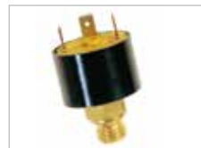
ELECTRICAL PRESSURE SWITCH