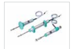
RECTILINEAR DISPLACEMENT TRANSDUCER