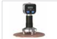
DIGITAL BARCOL HARDNESS TESTER