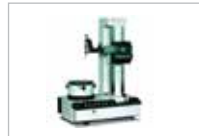
ROUNDNESS TESTING MACHINE