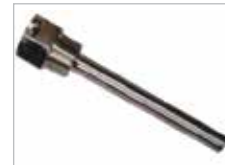
GRUB SCREW THERMOWELL