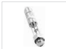
HIGH TEMP PRESSURE TRANSMITTER