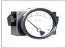
PISTON TYPE DP GAUGE