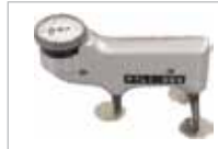
BARCOL HARDNESS TESTER