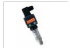
PRESSURE TRANSMITTER WITH DISPLAY