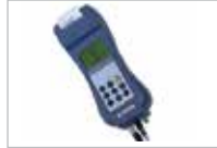
FLUE GAS ANALYSER