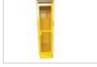
INDUSTRIAL CYLINDER CABINET