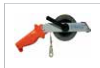
TANK DIPPING GAUGE