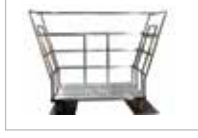
SS TROLLEY FOR AIRPORT VIP LUGGAGE HANDLING