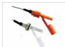
PLASTIC LEVEL FLOAT SWITCH