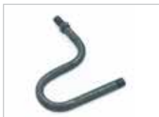
U - SYPHON