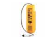
REFRIGERANT LEAK DETECTOR