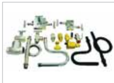
GAUGE MOUNTING ACCESSORIES