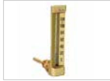
V SHAPED THERMOMETER