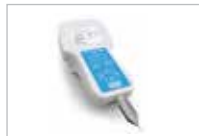
OXY BABY GAS ANALYSER