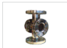
DOUBLE WINDOW SIDE GLASS