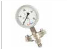
DIAPHRAGM PRESSURE- GAUGE