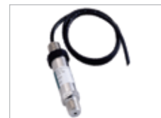
HYDROSTATIC PRESSURE TRANSMITTER