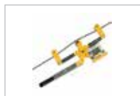
DIGITAL ROPE TENSION METER