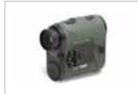
DIGITAL RANGE FINDER