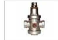
PRESSURE REDUCING VALVE