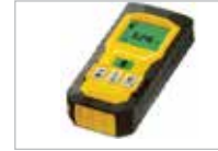
LASER DISTANCE MEASURING TOOL