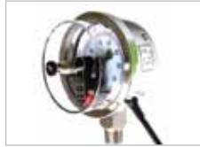
ELECTRONIC PRESSURE GAUGE