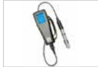
DISSOLVED OXYGEN METER