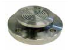
FLANGED FLUSH DIAPHRAGM SEAL