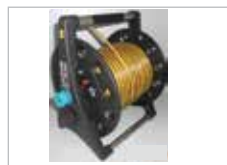
WATER LEVEL INDICATOR