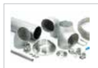
BUTT WELD FITTINGS