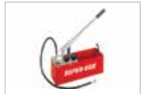
PRESSURE TEST PUMP MANUAL