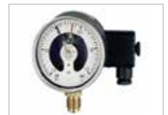
PRESSURE GAUGE WITH ELECTRIC CONTACT