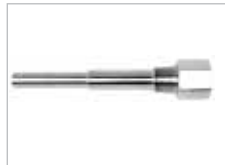
THERMOWELL WITH LAGGING EXTENSION