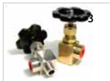
ANGLE TYPE NEEDLE VALVE