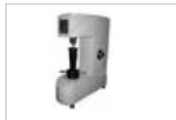
ROCKWELL HARDNESS TESTER