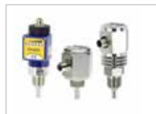
THERMAL DISPERSION FLOW SWITCH