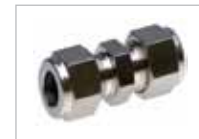
COMPRESSION - UNION