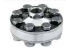
WELDED DIAPHRAGM SEAL