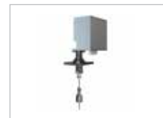
ELECTROMECHANICAL LEVEL MEASURING