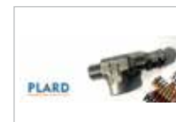
SS SAFETY RELIEF VALVE