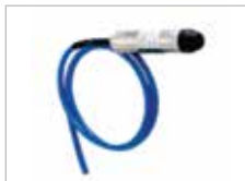
SUBMERSIBLE PRESSURE TRANSMITTER