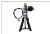
PNEUMATIC CALIBRATION PUMP