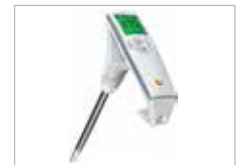
COOKING OIL THERMOMETER