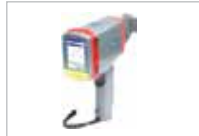
HANDHELD EDXRF SPECTROMETER