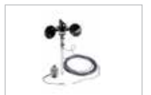
POLE MOUNTED ANEMOMETER