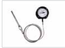
CAPILARY TEMPERATURE GAUGE