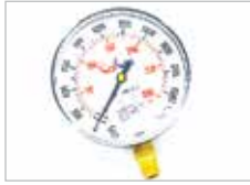
ABS UTILITY PRESSURE GAUGE