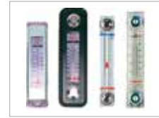
OIL LEVEL TEMPERATURE GAUGE