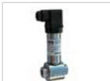
DIFFERENTIAL PRESSURE TRANSMITTER