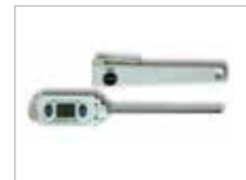
FOOD PROBE THERMOMETER