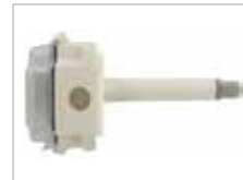
HUMIDITY TEMPERATURE SENSOR