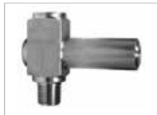
OVER PRESSURE PROTECTOR