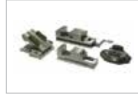
SINE ANGLE BASES