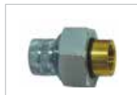
DIE ELECTRIC UNION