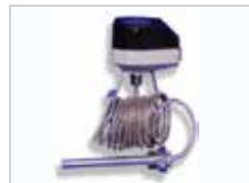
THERMOSTAT WITH CAPILARY