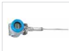
FLAMEPROOF TEMPERATURE TRANSMITTER