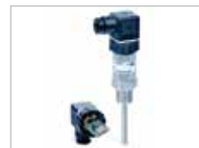
PT100 WITH USB