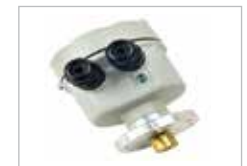
ROTATION SPEED MONITOR FOR CONVEYOR