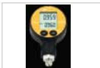
DIGITAL PRESSURE GAUGE