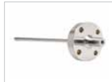
FLANGE TYPE THERMOWELL