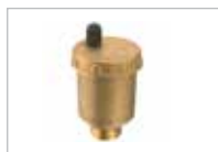
AIR VENT VALVE