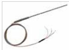
CABLE TYPE RTD / THERMOCOUPLE