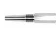
EXTENDED NECK THERMOWELL