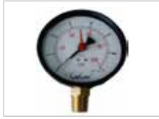
RED INDICATING POINTER GAUGE