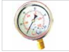
SS BRASS PRESSURE GAUGE