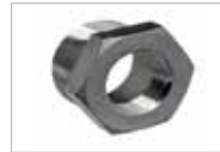
REDUCING HEX BUSH