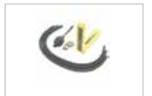
AIR TESTING U-GAUGE KIT