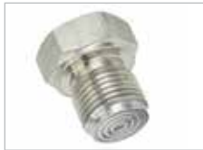
FLUSH DIAPHRAGM SEAL