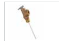
TEMPERATURE AND PRESSURE - RELIEF VALVE