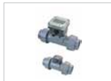
PADDLE WHEEL FLOW METER