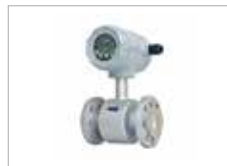
ELECTROMAGNETIC WATER FLOW METER