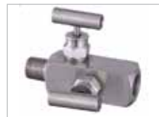
BLOCK & BLEED VALVE