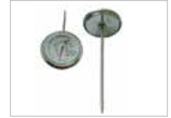
BI-METAL MEAT/ CONCRETE THERMOMETER