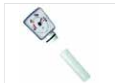
MT PROFILE - TANK CONTENT GAUGE