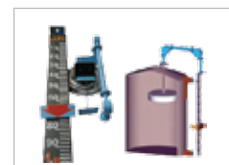
FLOAT & BOARD LEVEL INDICATOR