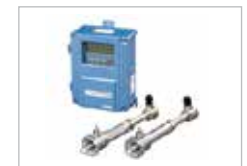
INSERTION TYPE ULTRASONIC FLOWMETER