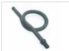
O - SYPHON