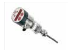
TEMPERATURE SENSOR WITH DISPLAY