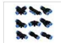
PUSH TYPE FITTINGS