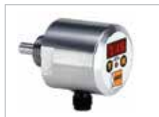
DIGITAL TEMPERATURE SENSOR