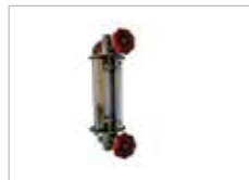
TUBULAR LEVEL INDICATOR