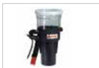
SMOKE & HEAT DETECTOR