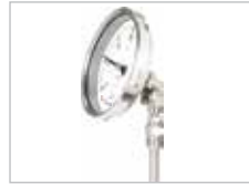
EVERY ANGLE TEMPERATURE GAUGE