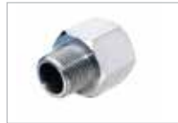
MALE X FEMALE ADAPTOR