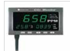
CO2 & TEMPERATURE MONITOR