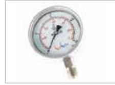
SS PRESSURE GAUGE