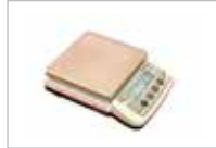
TABLE TOP SCALE