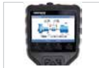
SPM SHAFT ALIGNMENT