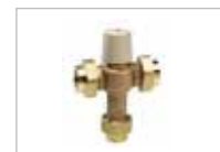
THERMOSTATIC MIXING VALVE