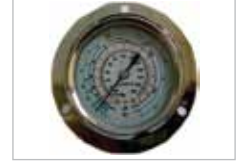
REFRIGERANT PRESSURE GAUGE