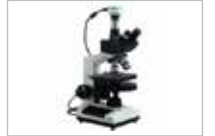
OPTICAL CENTERING MICROSCOPE