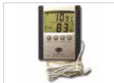
INDOOR-OUTDOOR THERMO HYGROMETER