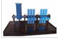
SKID AS PER ANSI