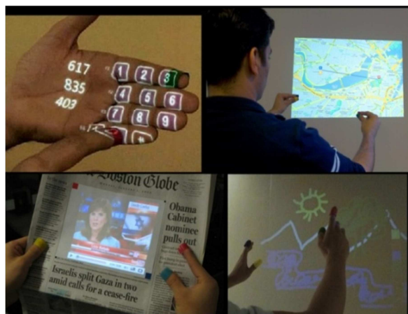
Figure 3. Devices of Sixth Sense Technology.

The working of the Sixth sense device can be easily seen by the following block diagram.