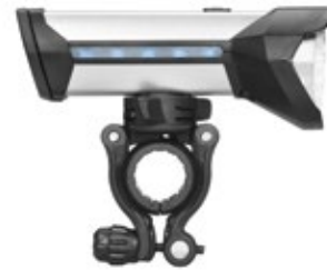
Lateral battery charge indicator: 1 LED = 20 % | 5 LEDs = 100 %