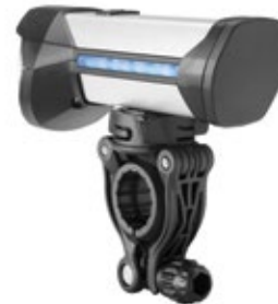
Incl. Swivel-lock handlebar bracket