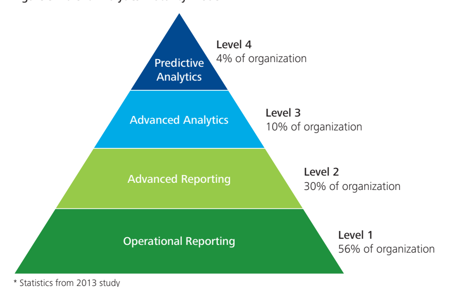
Figure 3: Talent Analytics Maturity Model

Unfortunately for companies, progress in developing full analytical capabilities is a slow, multi-year process. According to Deloitte's 2015 Global Human Capital Trends report, over the past year only 8% of organizations believed that they have a strong HR analytics team in place. Research<sup>III</sup> shows that the evolutionary journey to mature analytics typically lasts five to seven years.