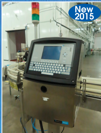
Videojet Can Coder Model 1620