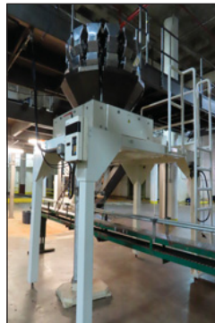
ISHIDA SCALES COMPUTERIZED WEIGHER MODEL CCW-S-212