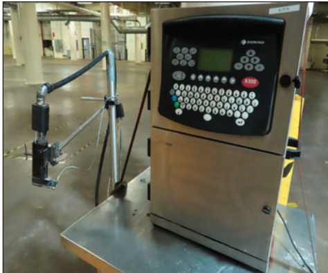
DOMINO INK JET PRINT SYSTEM MODEL A300