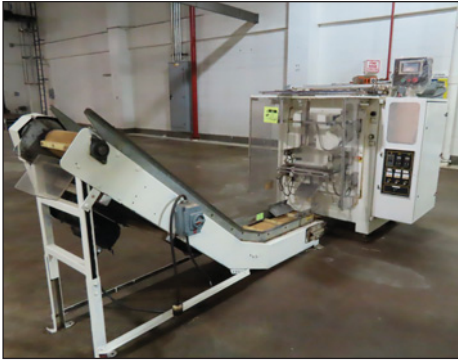
ILLAPAK FORM/FILL/SEAL MACHINE MODEL VEGATRONIC SP400