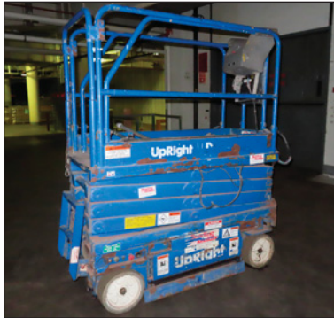
UPRIGHT ELECTRIC SCISSOR LIFT MODEL MX19