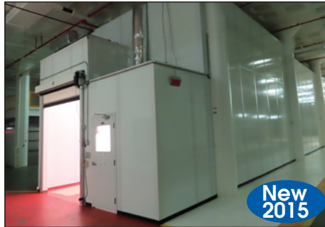
ANGSTROM TECHNOLOGY 26' X 80' CLEANROOM