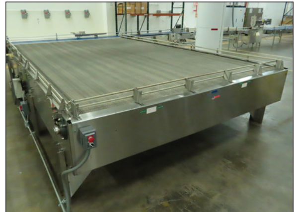
AMBEC 10' X 15' CAN ACCUMULATING TABLE