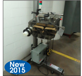
UNIQUE SOLUTIONS POUCH PLUS 1000 ELITE BAG INSERTER