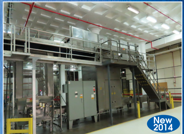
TopTier/Simplimatic Palletizer Model BDA-3200