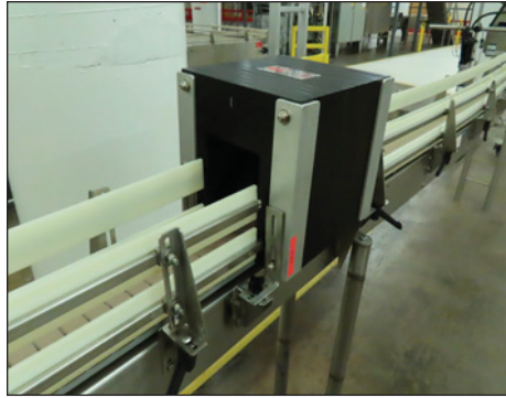
CARLETON HELICAL SYSTEMS INVERTER #502X504 CANS