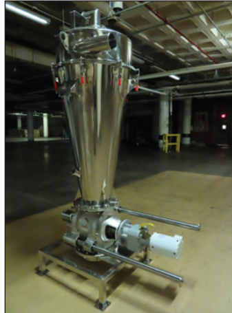
SPEE-DEE LOADER HOPPER, STAINLESS