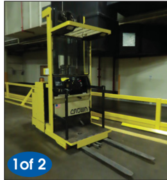
CROWN 3000 LB ELECTRIC STANDUP FORKLIFT