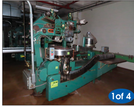
AUTOMATIC MACHINERY PNEUMATIC PACKAGING MACHINE, 34 HEAD