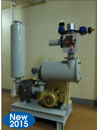
TUTHILL VAC-U-MAX PNEUMATIC VACUUM PUMP MODEL 01426MD