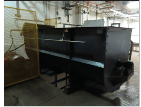
50 HP RIBBON BLENDER