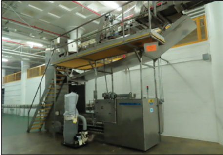
I&H ENGINEERED SYSTEMS CAN CLEANING SYSTEM