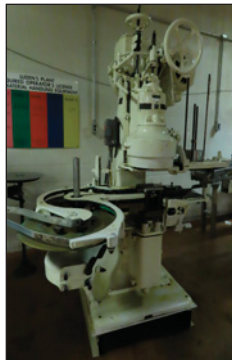
AMERICAN CAN CO. CANCO SEALER MODEL 8, NUMBER 0