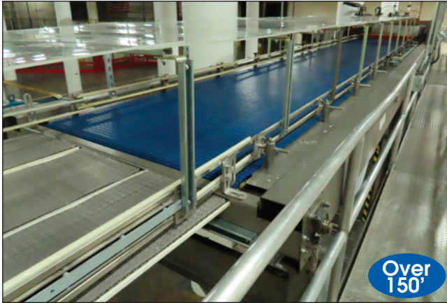
VIEW OF POWER CONVEYOR