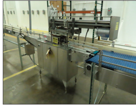
FORDS HOLMATIC OVER CAPPER MODEL PH-41SB