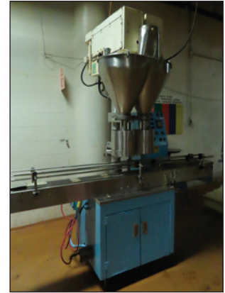
ALL FILL (AF) DUAL HEAD FILLING MACHINE MODEL 200104