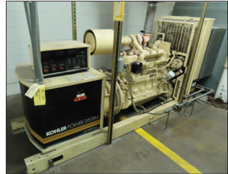
KOHLER POWER SYSTEMS BACKUP GENERATOR