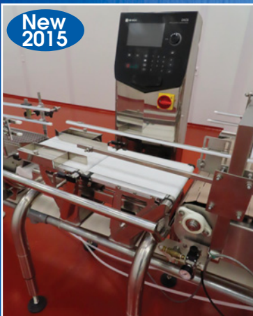
Ishida Check Weigher Model DACS-G-S015-23/SS-1-S

SALE DATE: Thursday, June 3, 1:00 PM (ET) INSPECTION: Wednesday, June 2, 9 AM TO 4 PM