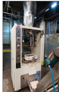
GENERAL PACKAGING FORM/ FILL/SEAL MACHINE MODEL 70