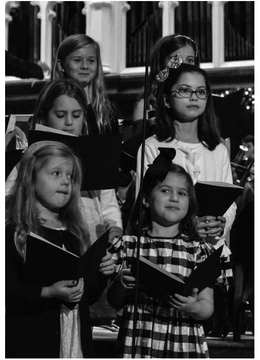
Scenes from the season (so far): Breakfast With Mary, the Youth Christmas Tree Sale and the Christmas concerts.