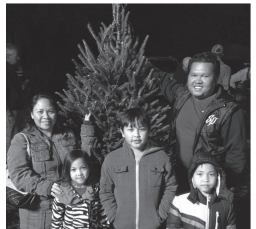
Our friends and their first fresh Christmas tree.

"Thank you so very much for beautiful pictures and everything today. Kids very happy to see first fresh Christmas trees. It's huge but they love it. You are blessing to us. May God bless you and your family with abundantly love. We got to meet nice, kindness and loving people there. Specially thanks to you how great you have loving us so much. Don't know what else to say beside thank you. I am humbly honor for all you done. We love the foods and Christmas tree ♥"