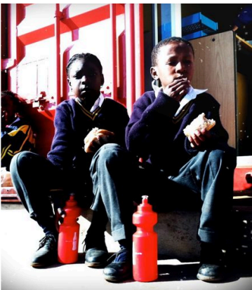
Feeding scheme for the children when they arrive at training.