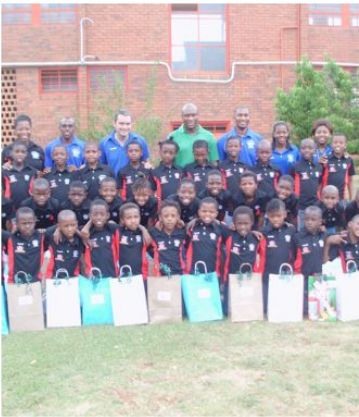
End of year awards ceremony - a fantastic day!