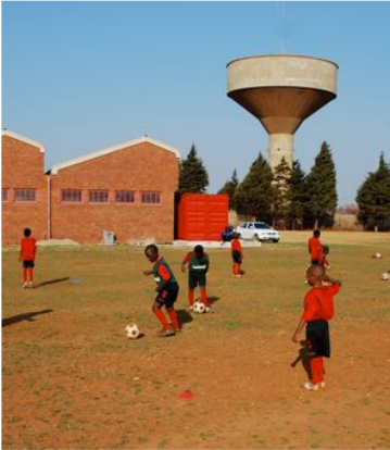
Football training at the Academy, we also laid a new field in 2011.