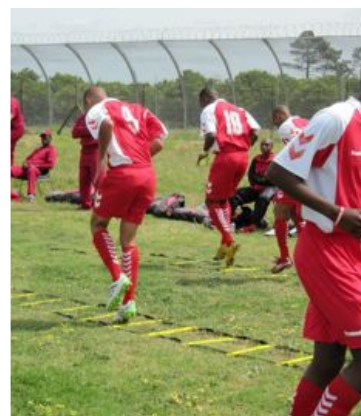
Intense training, the young men were exceptional in their football.