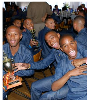
Academy players at the end of year awards in the prison.