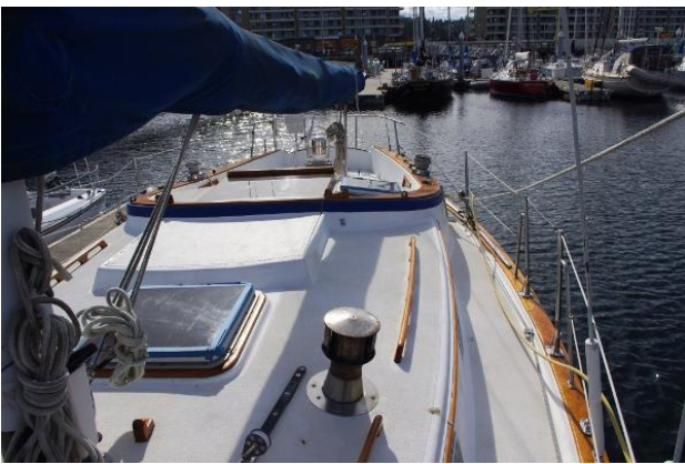
Port Cabin Top