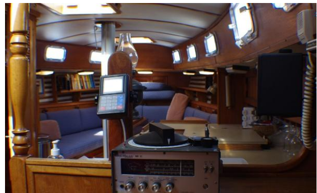
Nav area looking forward