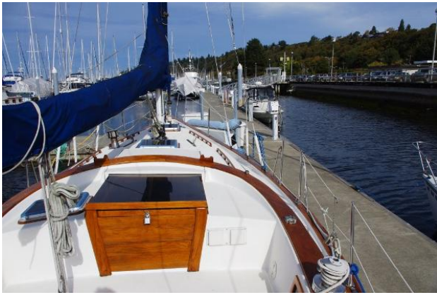
Aft Cabin Top