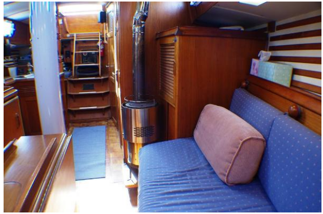
Looking Aft Portside