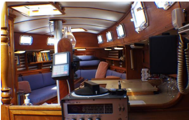
Nav area looking forward