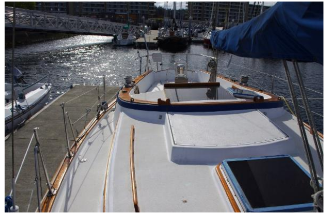
Starboard Cabin Top