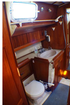
Head from Stateroom