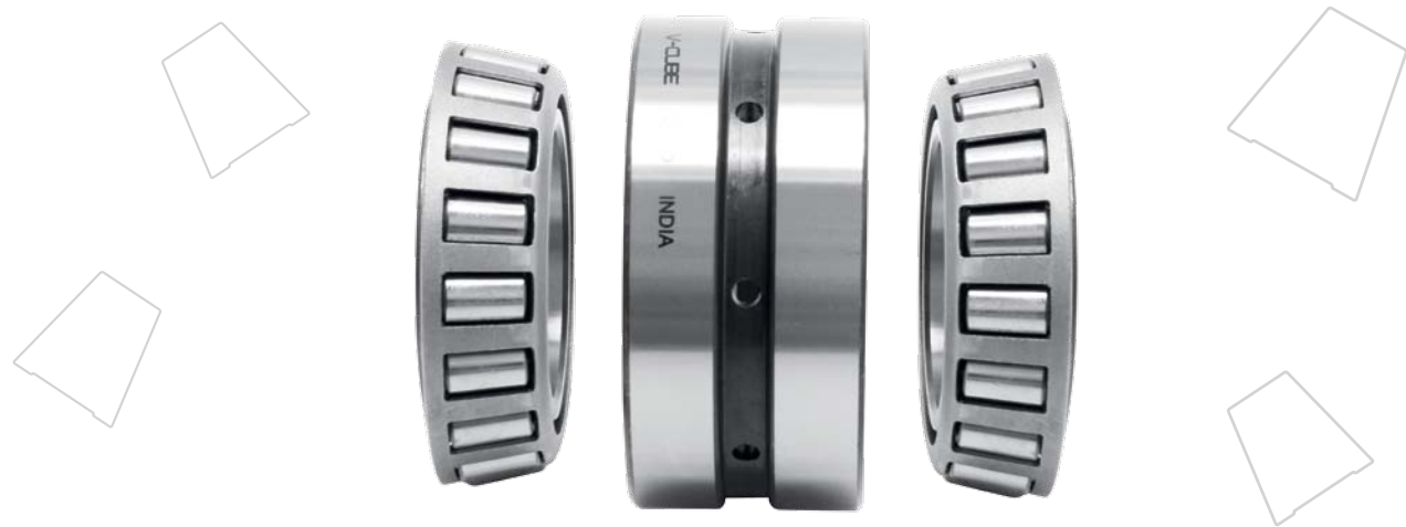
Double Row Taper Roller Bearings