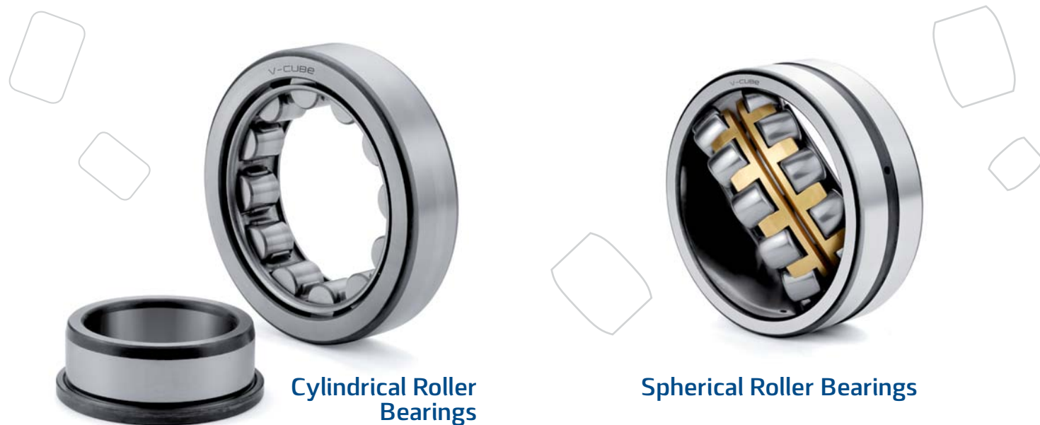
Cylindrical Roller Bearings