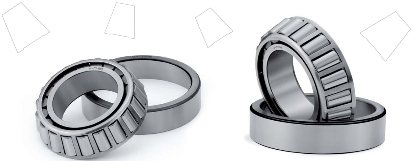
Single Row Taper Roller Bearings