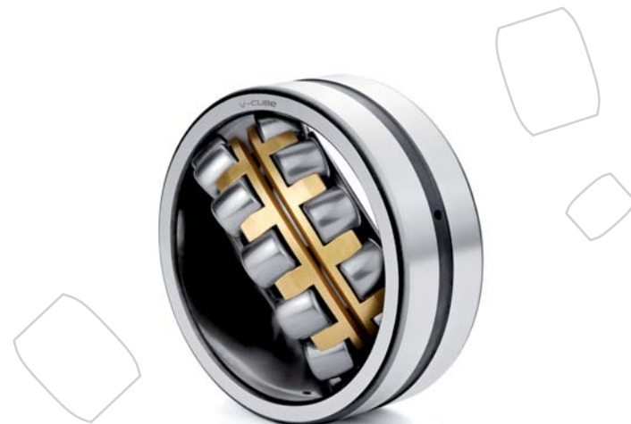
Spherical Roller Bearings