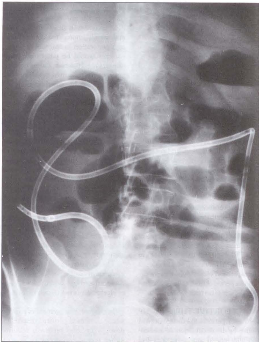
Figure 2) Radiopaque decompression tube placed in cecum

At the author's institute, between 1984 and 1989, 16 patients were treated with 17 decompressions. All patients were treated with conservative methods. When distension persisted or increased (all patients had cecal diameters of 12 cm or greater) endoscopic tube decompression was carried out (Table 3). All intubations were successful and no complication was encountered. All patients except one survived and left the hospital. The one patient died seven days after successful