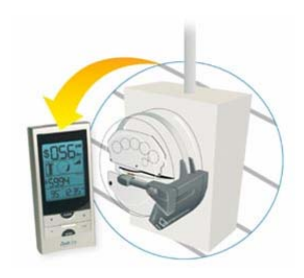
Power Cost Monitor