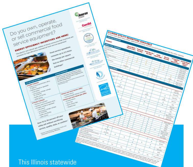
Figure 1: Example of Co-Branded Marketing Document

This Illinois statewide CFS flyer highlights the offerings of all electric and gas utilities and the Department of Commerce and Economic Opportunity, making it easier for customers and suppliers to understand incentives.