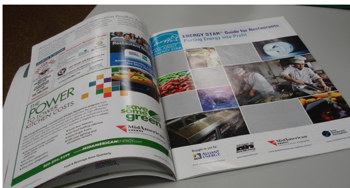
Figure 2: Example of Co-Branded Incentive Booklet

Be creative when publicizing your progress! The Iowa Restaurant Association (IRA) has collaborated with three ENERGY STAR utilities in Iowa to leverage the ENERGY STAR Guide for Restaurants and feature it as a tear-out in the December 2011 edition of the IRA's Food & Beverage Quarterly. The above is a release of the final IRA mailing, which EPA showcased in the April 2012 CFS Newsletter.