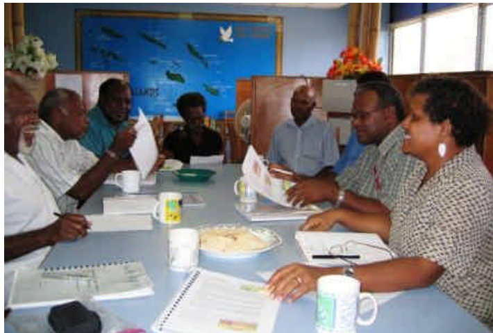
Senior staff of the Department of National Unity, Reconciliation and Peace discuss the Gendered Early Warning Report.

One of the most critical elements of any conflict early warning system is the link from warning to response. In the case of UNIFEM's Solomon Islands project, for each of the 46 indicators a set of corresponding response options was developed by male and female community members and partners, taking into account a gender perspective. Conflict prevention and peace building are the concern and responsibility of people at all levels – not just of national governments. Therefore, response options were developed for the community level – initiatives and actions which communities themselves identified and could undertake – as well as for the national level, including initiatives and policies for government, national NGOs, churches and donors. These were included in matrix form in the early warning reports.