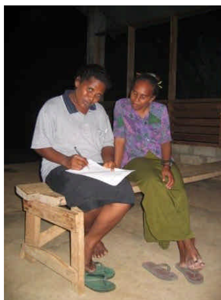
Conducting Community Surveys in an urban squatter settlement.