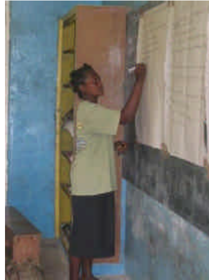
Male and female project participants monitoring peace and conflict.