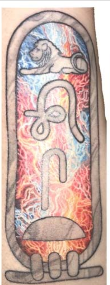
Left: LOST (the bad guys)