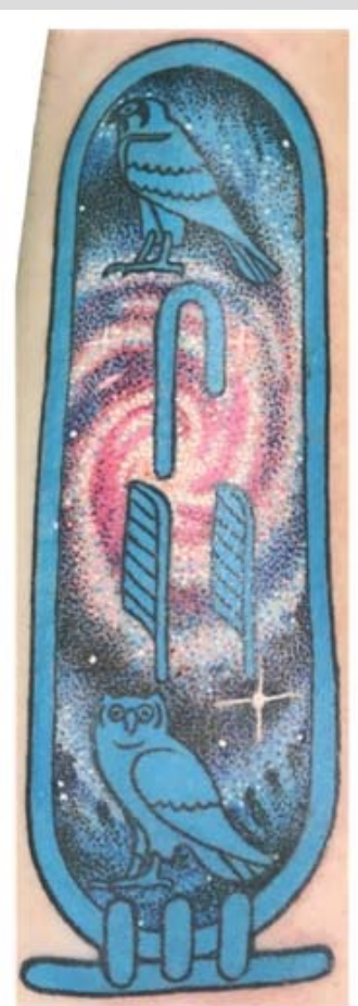
Right: ASIM (the good guys)