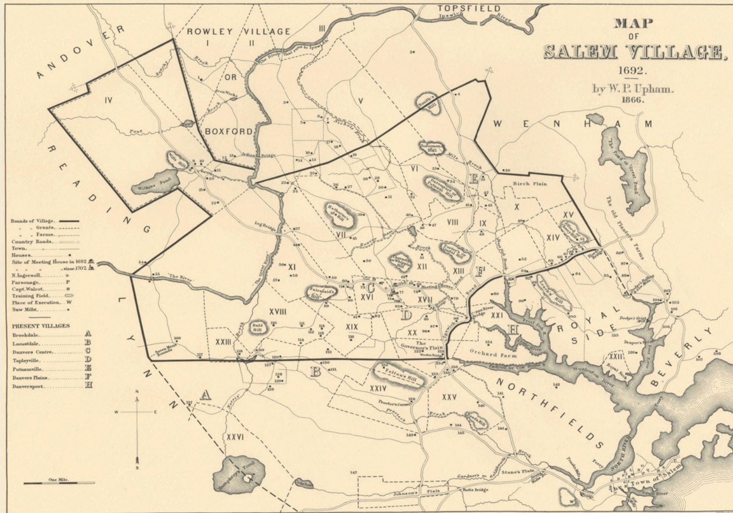
MAP OF SALEM, MASSACHUSETTS, 1692

http://www.salemwitchtrials.org/salem/witchcraft/maps/uphamla1.jpg