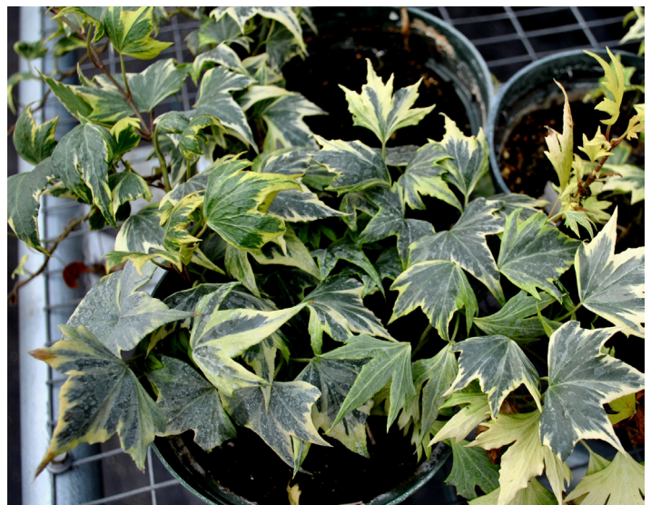
Figure 1. There are many varieties of English ivy varying in leaf morphology and pigmentation.

English ivy is very disease-resistant, with only a few major diseases causing economic losses in production and in landscape plantings. This EDIS publication will assist commercial ivy growers in identifying and treating various diseases. This publication also will assist residential or commercial property owners in identifying various English ivy diseases.