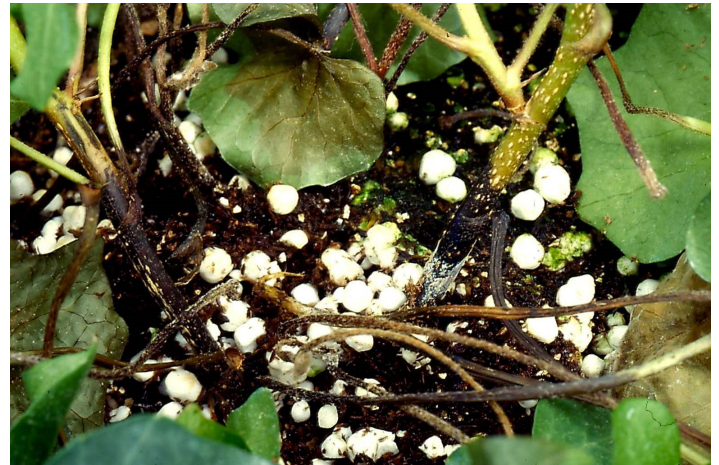
Figure 4. Fusarium root and stem rot of English ivy. Note the white spores on rotten stem.

Fusarium root rot disease is almost identical to symptomology seen with Phytophthora . The key distinguishing characteristic of Fusarium root rot is that English ivy stems at the soil line become covered with a thin layer of white dust-like material. This dust-like material is actually millions of spores, which have formed on the exposed surface of the plant (Figure 4). These spores are easily splashed or blown to nearby plants.