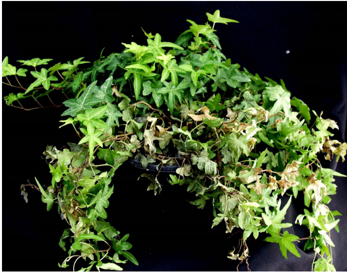
Figure 3. Phytophthora root and stem rot of English ivy.

These spores are released when there is either rain or irrigation. Irrigation runoff and their ability to swim help facilitate the spread of this pathogen. Zoospores can remain active for hours to days depending on the temperature and moisture.