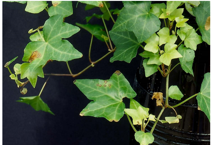
Figure 7. Colletotrichum leaf spot of English ivy.

Small light-brown leaf spots are the first symptom of Colletotrichum leaf spot on English ivy. As the disease progresses, they enlarge and become dark brown (Figure 7). As these lesions age, small, dark structures form on the lesion surfaces, many times in concentric rings. These structures are referred to as acervuli, and within each acervuli, thousands of spores are produced (Figure 8). These spores are easily spread from plant to plant via water and wind movement. Colletotrichum trichellum , a fungus, is the causal agent for this disease.