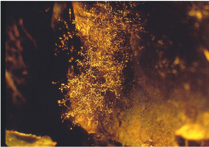
Figure 6. Botrytis blight of English ivy. Note the grey-brown fuzz made up of spores and fungal hyphae.