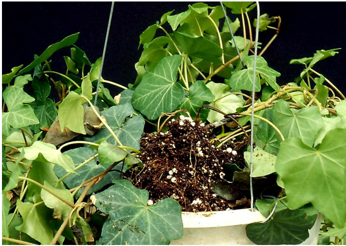
Figure 5. Rhizoctonia root rot of English ivy.

English ivy plants will appear wilted. Leaves will look yellowed or chlorotic. Roots and stems will slough off when handled. The symptoms of Rhizoctonia root rot on English ivy are similar to those observed with Phytophthora and Fusarium , as seen in Figure 5, although Rhizoctonia is typically not as common.