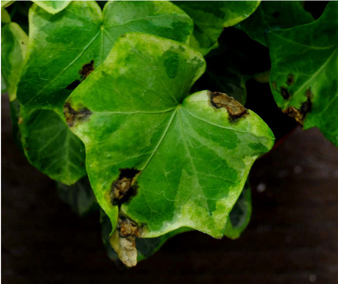
Figure 2. Bacterial leaf spot of English ivy. Note the water soaked oily circles surrounding the lesions.

Irregular, water-soaked, dark, and necrotic leaf spots are the most common symptoms observed (Figure 2). Water-soaking can be observed by holding the leaves up to the light; you will then see an oily circle surrounding the lesion. Depending on the ivy cultivar and leaf pigmentation, a chlorotic (yellow) halo can be seen surrounding the leaf spot. As lesions age, the centers become papery and may fall out, leaving a “shot gun” appearance to the leaves.