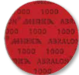
#1000 for fine scratches and return to factory sanded finish EQUIP076EA