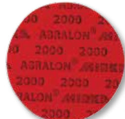
#2000 for mild luster with texture underneath EQUIP077EA