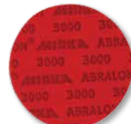
#3000 for medium luster with light texture EQUIP07730EA