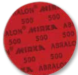
#500 for medium scratches EQUIP075EA