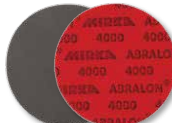
#4000 for high luster with smooth texture EQUIP078EA