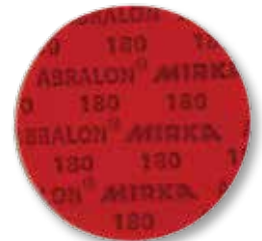
#180 for deepest scratches EQUIP073EA