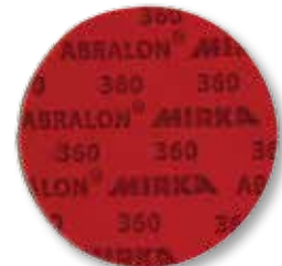
#360 for deep scratches EQUIP074EA