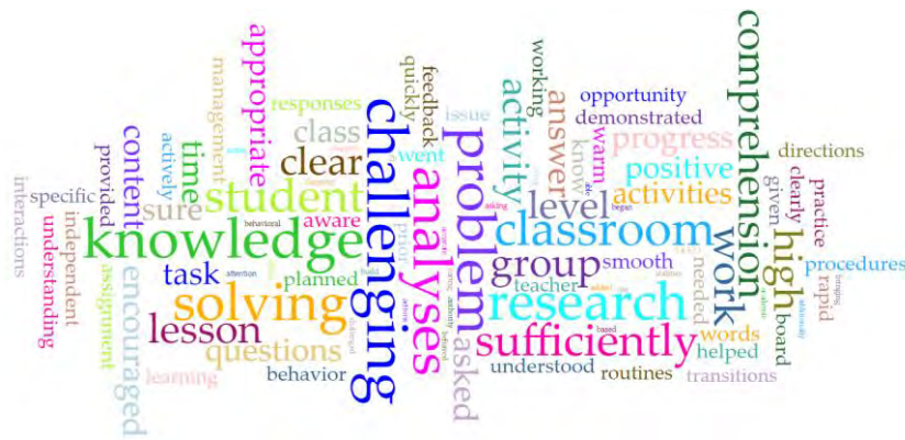
Figure 2. The frequency of the use of the terms identified by the Voyant Tools in the corpus of the reports

These were consolidated and analysed using the Voyant Tools. The most frequent words in the corpus of the reports were as follows: challenging, analyses, knowledge, problem, and research.