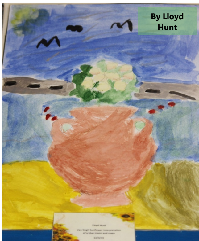
By Lloyd Hunt