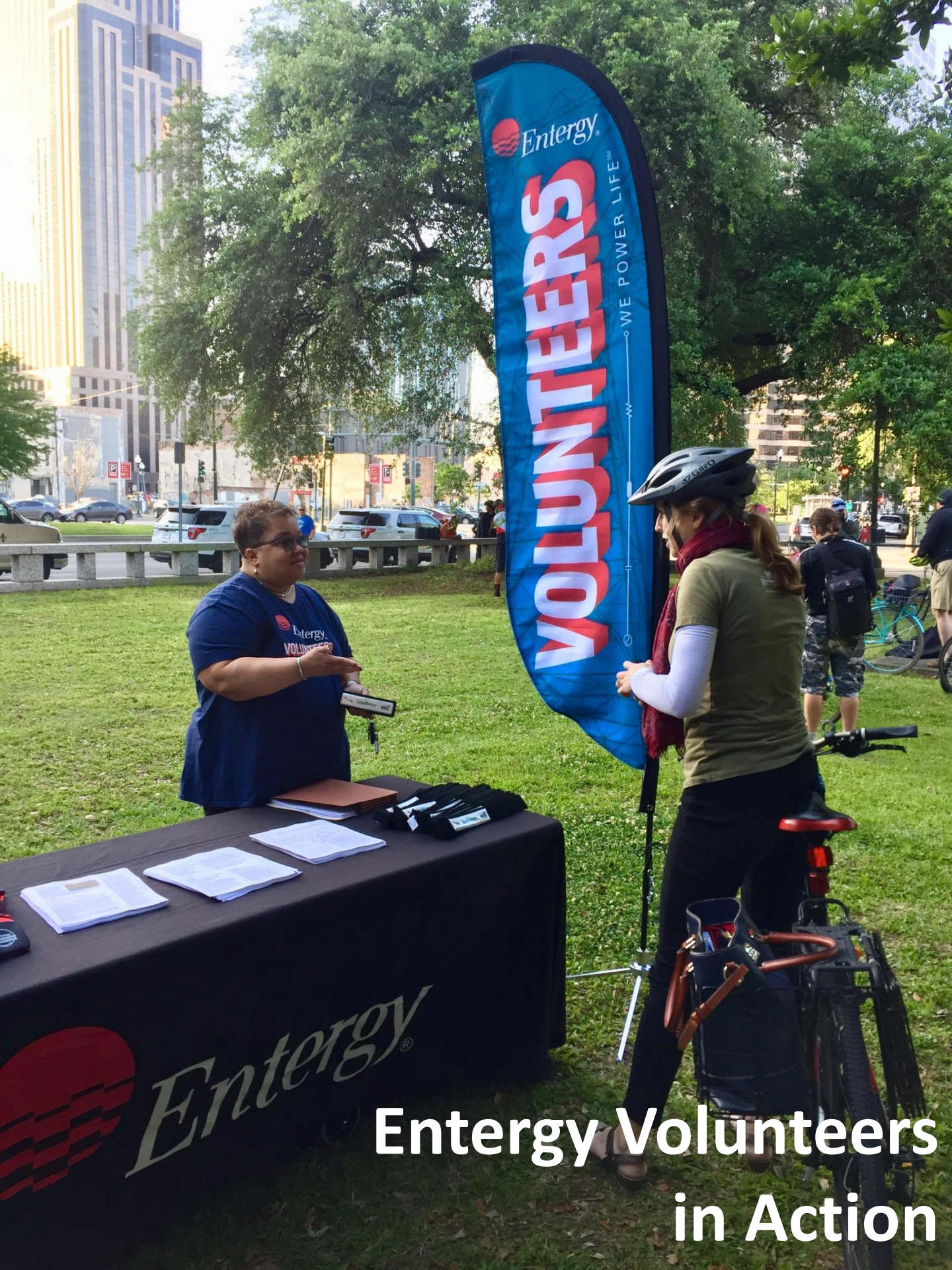
Entergy Volunteers in Action