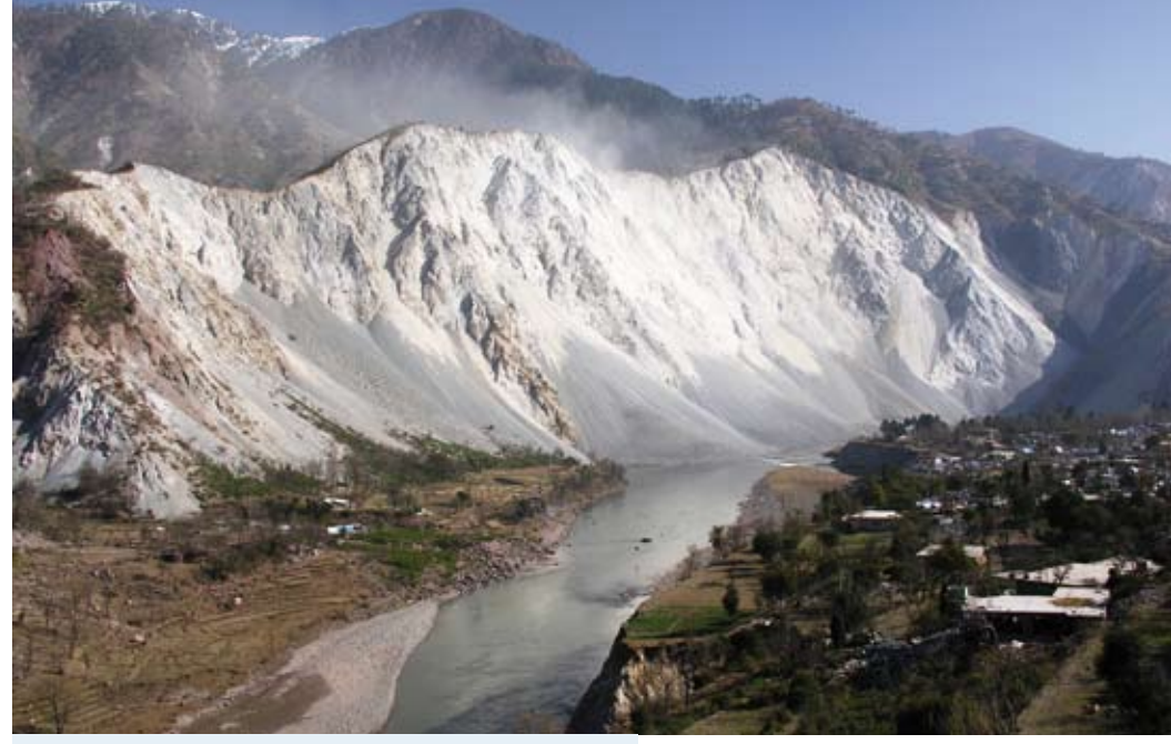
The October 2005 earthquake in Pakistan, which caused this landslide at Muzaffarabad, continues to present recovery challenges.