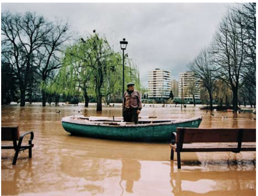
Adrift in an urban park. Climate change is causing an increase in the frequency and intensity of extreme weather events.

This discussion paper aims to address the complexity of risk in this 'two-way system' between environment and human societies.