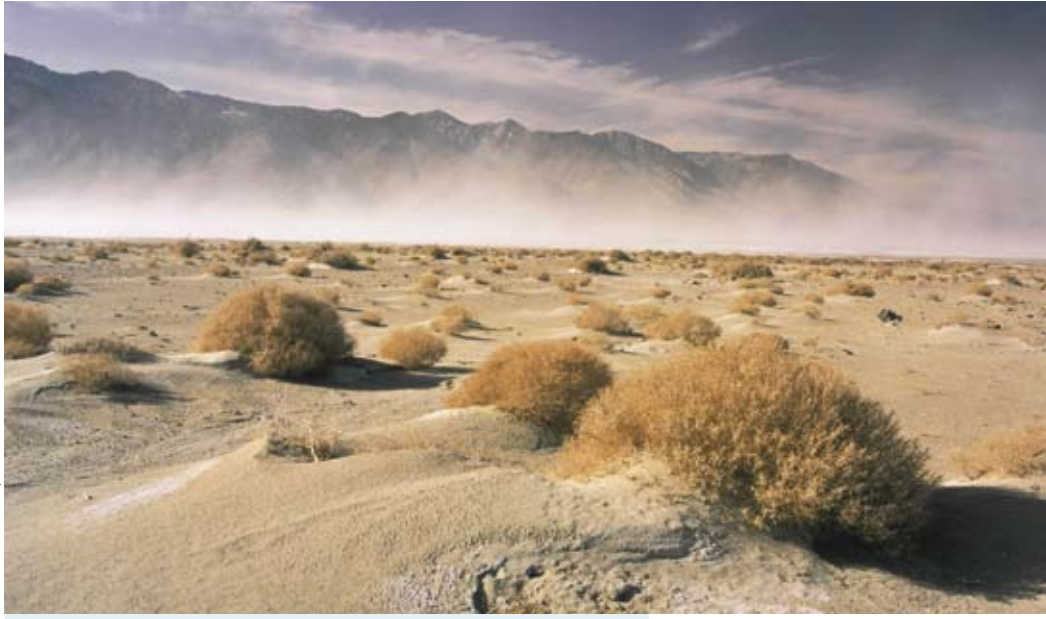
View of a desert storm. Land degradation, including desertification, forces communities onto marginal lands and increases their vulnerability to disasters.