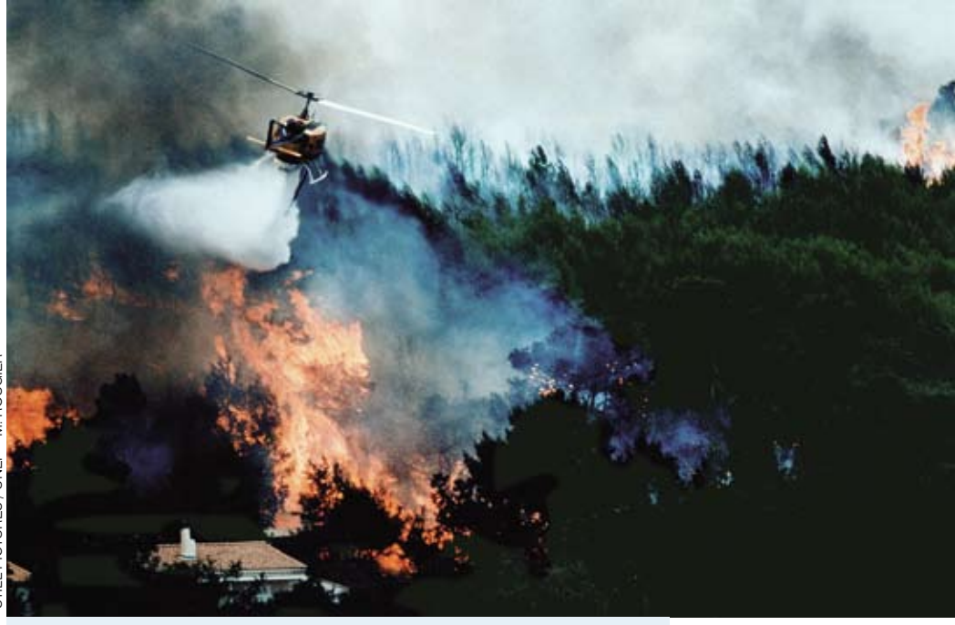
Fire fighters protect neighbouring communities in their response to a forest fire in France.

The integration of industry emergency plans with local emergency response plans into one overall community plan to handle all types of emergencies is the basis of a multihazard multi-stakeholder approach to emergency preparedness. In this respect, it is of the utmost importance to promote the involvement of all members of the community in the development, testing and implementation of the overall emergency response plan, promoting awareness of the underlying risks, and plan ownership.