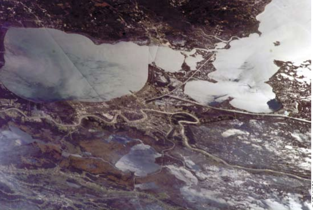
A photo taken on 18 November 2006 from the International Space Station shows New Orleans, USA. Sunglint accentuates the wetland setting by highlighting the numerous lakes, ponds, and rivers surrounding the city. Healthy wetlands perform the important functions of water quality control, absorption of flood waters and providing habitats for plant and animal species.