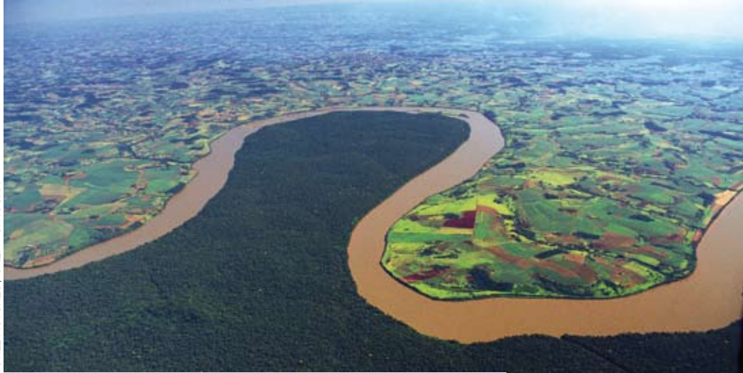
A bend in the Iguaco River shows the contrast between dense forest and agricultural expansion. The undisturbed forest on the near bank is part of the Iguacu National Park.