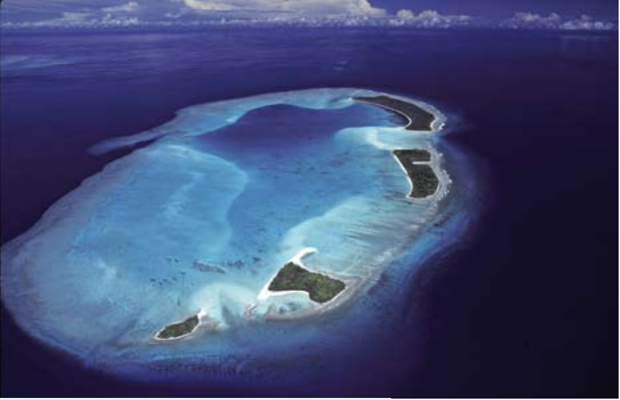
Kayangel Atoll in Palau, like other small island states, are in a particularly precarious position with regard to global sea level rise.

The focus on environmental change as a parameter of risk also reminds us that risk is dynamic and changes over time. Risk assessments, therefore, need to account for dynamic risk through better models as well as frequently updated assessments.