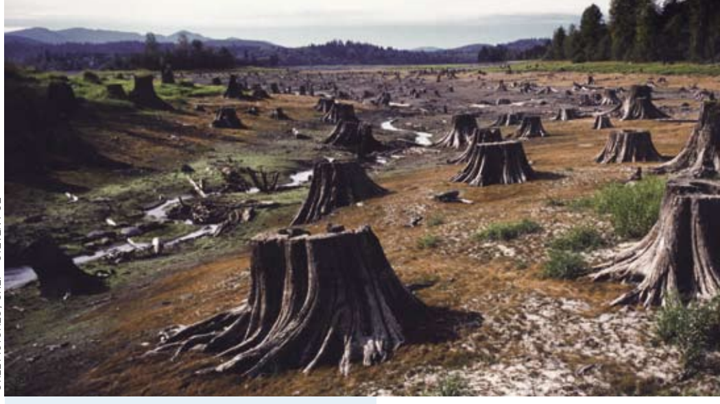
Loss of biodiversity leads to a decrease in ecosystem productivity, biological resources, ecosystem services and social benefits.

elaborated by the disaster reduction community also provides a valuable framework for analyzing patterns of vulnerability to environmental change and identifying opportunities for reducing that vulnerability.