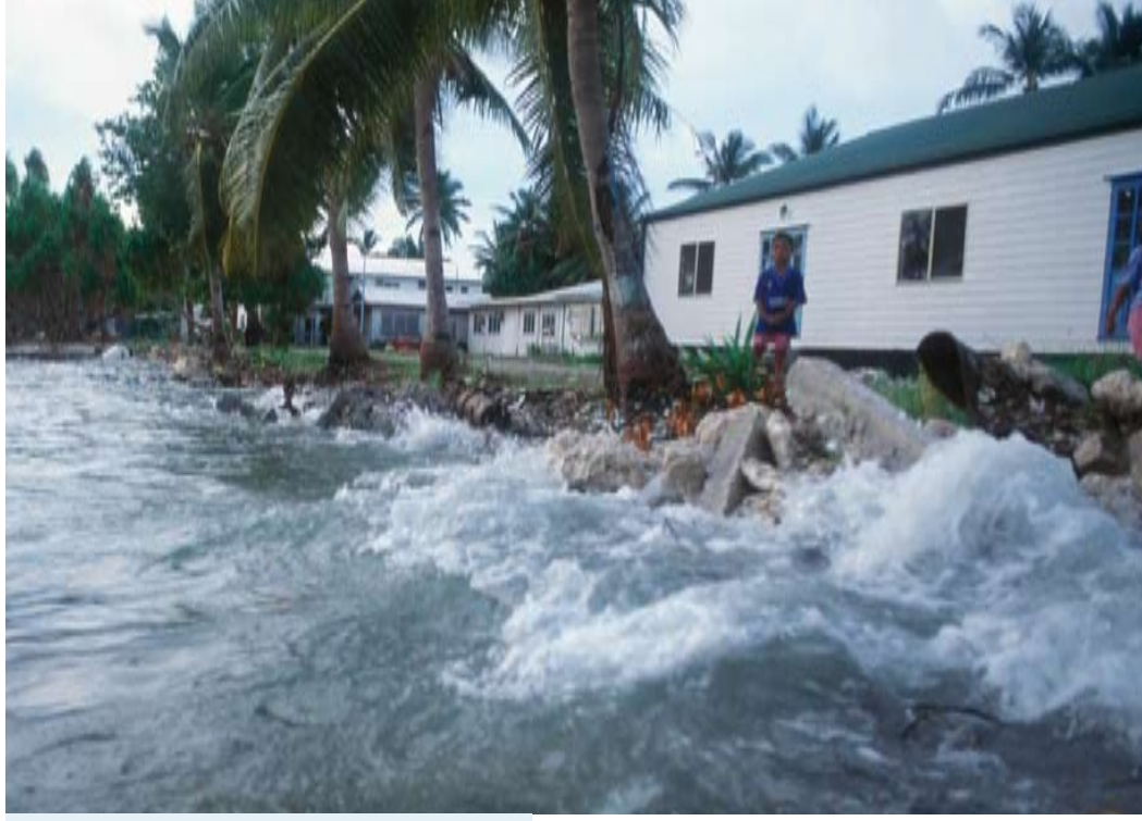
Waves from the atoll lagoon threaten buildings in Tuvalu, Funafuti, during exceptionally high tides in February 2002.

Environmental degradation, settlement patterns, livelihood choices and behaviour can all contribute to disaster risk, which in turn adversely affects human development and contributes to further environmental degradation. The poorest are the most vulnerable to disasters because they are often pushed to settle on the most marginal lands and have least access to prevention, preparedness and early warning. In addition, the poorest are the least resilient in recovering from disasters because they lack support networks, insurance and alternative livelihood options.