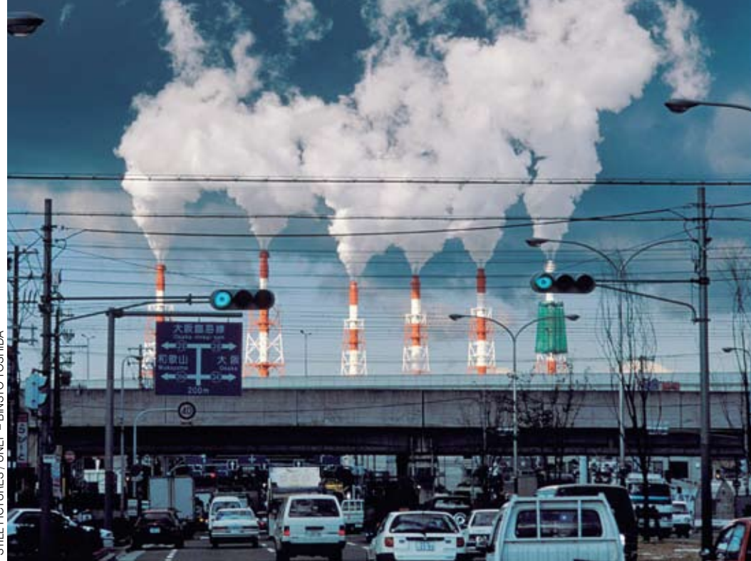
Industrial pollution is contributing to the production of greenhouse gases – a major cause of global warming.

Events such as floods, droughts and earthquakes are designated as 'hazardous' because they threaten human communities or the elements that we value. Hazards are expressions of the earth's physical processes. However, the myth that we have little influence over the occurrence of tropical cyclones or rainfall shortages has been exposed: human activities have an impact on the timing, magnitude and frequency of these physical processes. Human endeavours have triggered global warming and thereby affected the frequency and intensity of extreme climate events. On a local scale, deforestation and desertification have demonstrable effects on local rainfall patterns and are complicit with the occurrence of drought.