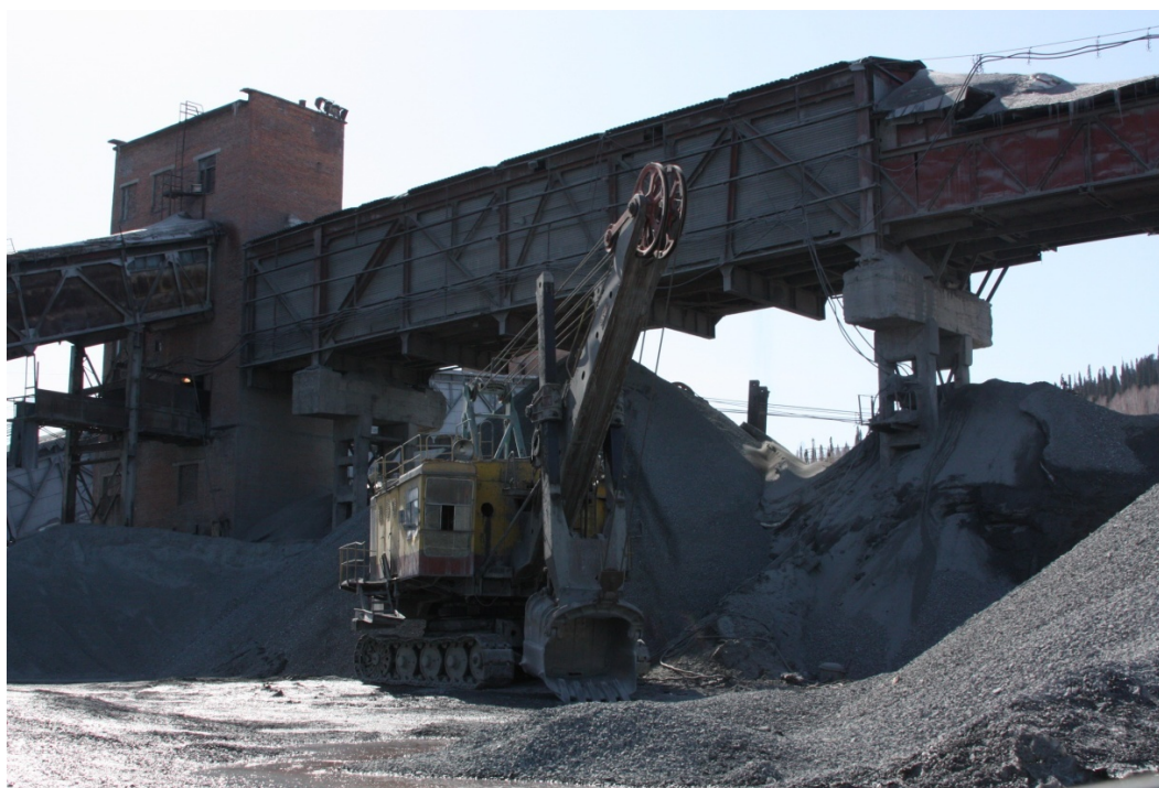
A coal mine in the village of Sheregesh, Kemerovo Region. The coal mining industry remains one of the most dangerous in terms of occupational hazards.

Classified as one of the most hazardous industries, the coal industry is responsible for causing 84% of all occupational illnesses in Russia. 30 Records show that the main increase in occupational illnesses in Russia in 1996 to 2003 was accounted for by the health impacts of the coal industry: between 29.4 and 91.7 cases per every 10,000 employees, with the average range across Russia estimated at 1.77 to 2.24 cases.