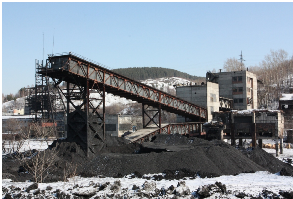
Abashevskaya Coal Mine, Kuzbass. Just like coal combustion at power plants, coal mining is a major source of a variety of ecological impacts that can severely affect the health and well-being of local populations.

region, the overall rate of newly diagnosed malignancies had increased by 9.7%. A carcinogenic risk assessment performed for the cities of Kemerovo, Novokuznetsk, and Prokopyevsk revealed that annual population cancer risk – or the increase in incidence of oncological disease over annual background rates – was 0.4 cases for Prokopyevsk; 1.6 cases for Novokuznetsk; and 2.3 cases for Kemerovo. 38 The calculated individual lifetime cancer risk for the populations of these cities was estimated at 3.1 \times 10^{-4} for Kemerovo; 1.9 \times 10^{-4} for Novokuznetsk, and 1.2 \times 10^{-4} for Prokopyevsk. By medical standards, such risks to human health are unacceptable.