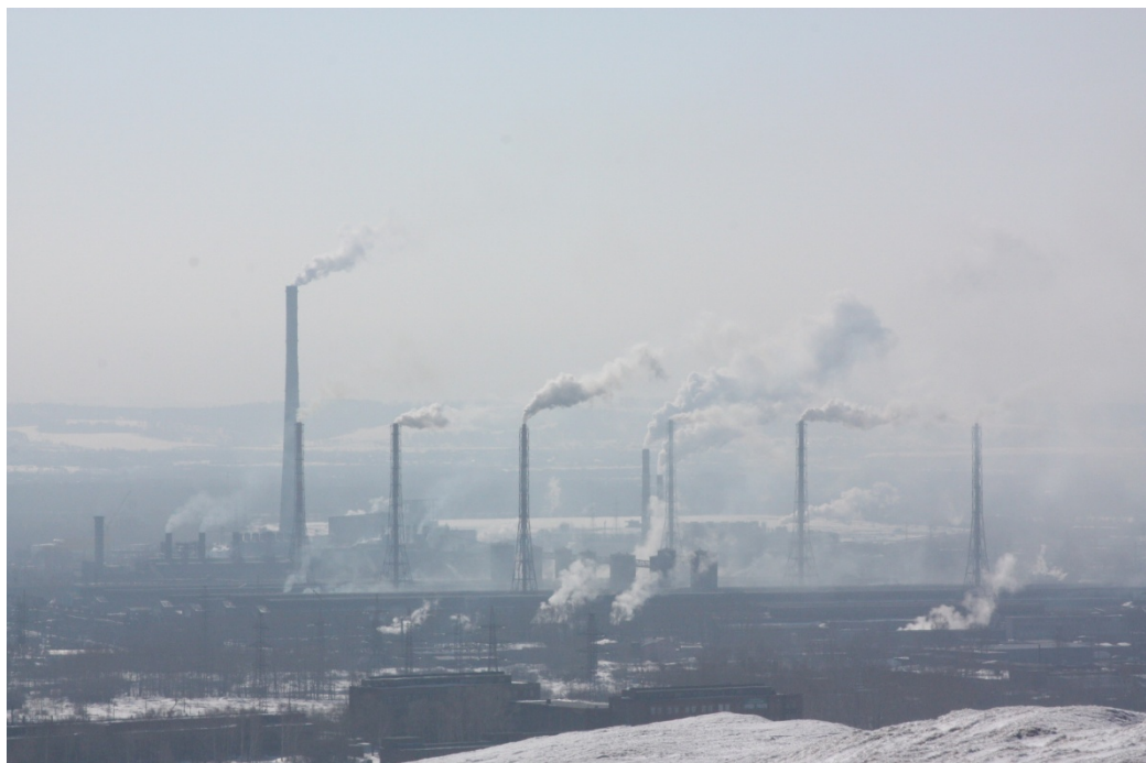
Novokuznetsk, Kemerovo Region, has one of the highest air pollution levels in the country.

According to information provided by the Federal Service for Hydrometeorology and Environmental Monitoring (Rosgidromet) in Yakutia, residents of the coal mining city of Neryungri suffer from the worst air pollution levels in the republic. The main components of the smog that periodically shrouds the city of Neryungri, in Rosgidromet's data, are formaldehyde (8.3 times the allowable limit), benzo[a]pyrene (2 times the allowable limit), and nitrogen dioxide (2 times the allowable limit). Air pollution levels in Neryungri put it on the list of Russia's worst polluted cities.