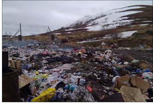
Many villages rank their landfill as a high priority

Environmental Survey in this manual as a model, You should add or delete issues from the survey based on issues specific to your community. Each and every person in the community should be encouraged to participate. Start by creating a checklist with everyone in the village on it, then make it your mission to get completed surveys from each person on the list. Taking the survey door to door and asking each person if they have a few minutes to complete it, usually helps to get a higher participation rate. If the person doesn't have time, ask them when a better time would be and let them know that you'd be back.