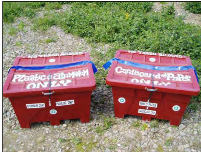
Savannah Yatchmeneff tests out the recycle bins crafted out of old fish totes in King Cove