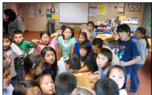
Involving children in environmental planning is not only educational, but insures that environmental planning will continue with future Generations Napaskiak 2011

As a planning team, it's important to remind yourself why you are involved, and why you are concerned about your community's wellness. Sharing the stories from past projects and programs is a great way to remind your planning team why you are there and what you are working for.