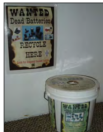
Battery recycling in King Cove