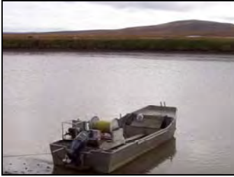
Tununak River