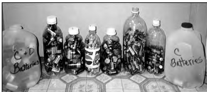
A simple solution for keeping batteries from polluting the landfill

BATTERY RECYCLING For the most up to date storage and collection information contact Total Reclaim in Anchorage or visit http://www.totalreclaim.com/alaska.html