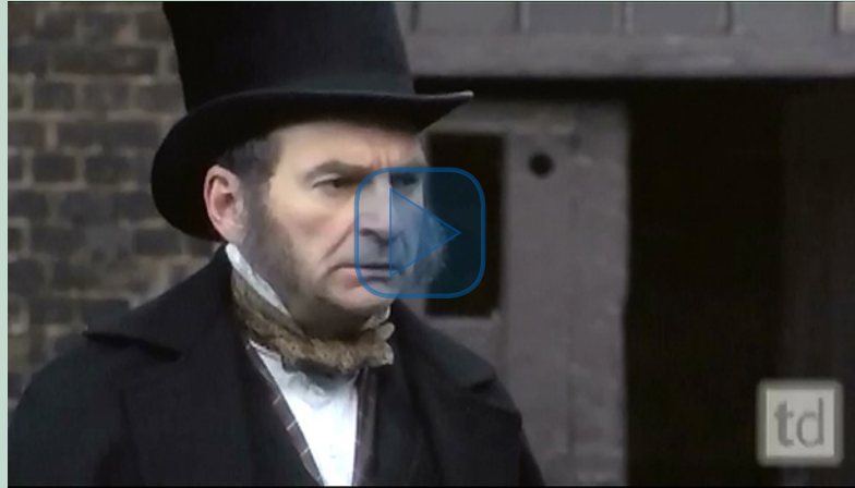
John Snow: Pioneer of Epidemiology video (Clicking on image or link below opens video in Web browser)

Watch this video, John Snow: Pioneer of Epidemiology , funded by the National Institute of Environmental Health Science (NIEHS), to see how John Snow, one of the first epidemiologists, who in the 1850s traced a major outbreak of Cholera in London.