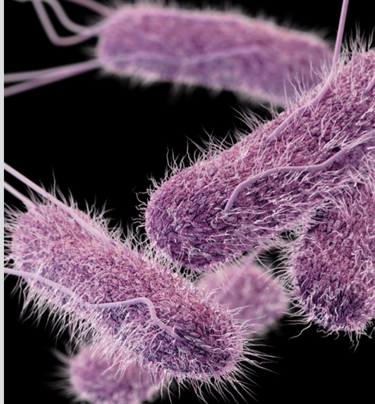
Artist's 3-D rendering of Salmonella bacteria

For further information and practice with real-life outbreaks visit the CDC's Epidemiologic Case Studies website. Here you will be able to interact with computer-based case studies , classroom case studies , and an outbreak simulation . These simulations require download and may be used offline.