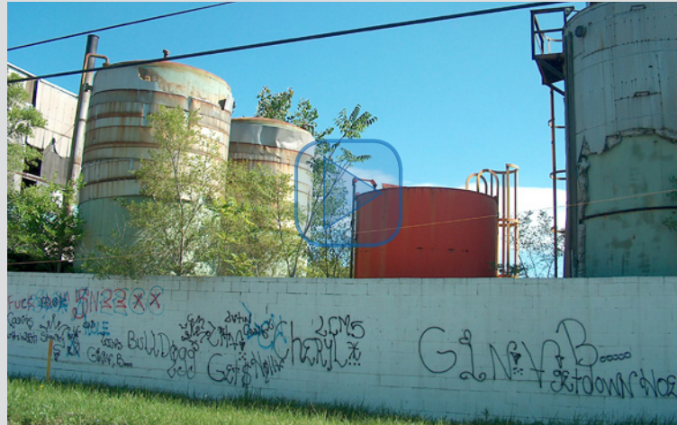
Deteriorated former chemical storage tanks (ATSDR, 2010)

The video entitled Environmental Justice in Dallas , discusses the health effects of lead exposures and about how community involvement can make a difference.