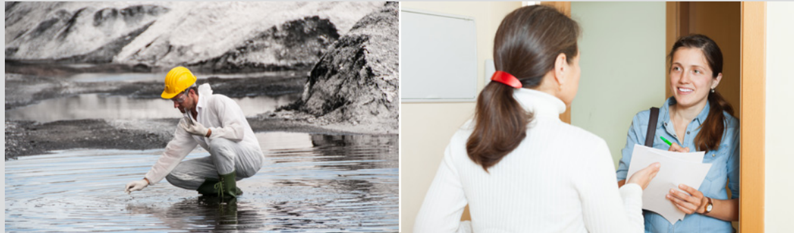
Left to right: Water sampling, surveillance

To learn more about the role the environment plays on public health go to the lesson funded by NIEHS Teaching Environmental Public Health: The Role of Epidemiology . In this lesson you will be able to explore a few short videos on the history of epidemiology and about potential disease clusters due to environmental exposures.