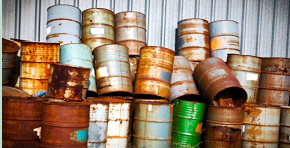
Drums containing potentially hazardous waste.

Environmental epidemiology is concerned with environmental conditions or hazards that may pose a health risk to populations. 1 For example, epidemiologists may investigate a cancer cluster in a particular community, or question whether people with a particular disease have higher levels of exposure than people without the disease.