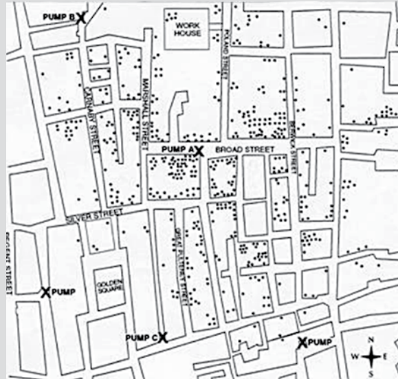
Map of Cholera outbreak used by John Snow

To learn more about the basics of epidemiology and biostatistics check out the “self-study course” designed by Centers for Disease Control and Prevention (CDC) on Applied Epidemiology and Biostatistics . This course is designed to describe key features of epidemiology, and provide explanations for calculating and interpreting several key epidemiological elements. This course also describes the steps to successfully conducting an outbreak investigation.